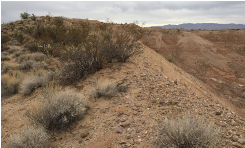
Figure 3. Reference community on left, eroded slopes on right

The potential plant community on this site is a mixture of desert shrubs, cacti, perennial grasses and forbs. Annual grasses and forbs make up a small percentage of the potential community. The aspect is shrubland.