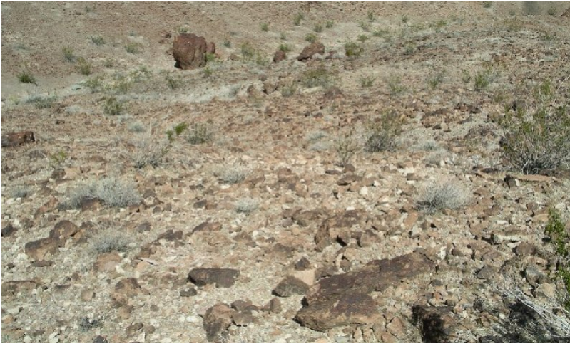
Figure 4. Reference Community

The reference community is characterized by widely spaced shrubs, 0.5 to 2 meters tall. Creosote bush and burrobush dominate. Brittlebush ( Encelia farinosa ) is occasionally present, and the cacti strawberry cactus ( Mammillaria dioica ) and beavertail pricklypear ( Opuntia basilaris ) are often present. Forbs are more common in years of high precipitation, but desert Indianwheat ( Plantago ovata ) is present in most years. Native annual and perennial grasses are present with low cover and production and include desert low woollygrass ( Dasyochloa pulchella ), sixweeks threawn ( Aristida adscensionis ), and sixweeks grama ( Bouteloua barbata ). The non-native Mediterranean grass ( Schismus spp.) is present with low cover.