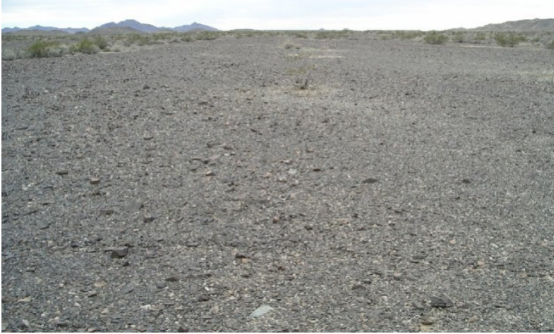
Figure 3. Desert Pavement