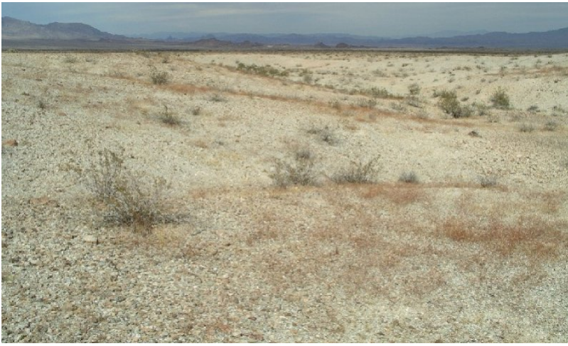
Figure 3. Reference Community

This community phase is dominated by sparse, very small creosote bush at 1 to 3 percent cover, with an occasional burrobush or white ratany ( Krameria grayi ) shrub. Certain areas can have a diversity of cacti as a minor component. The small statured native perennial grass low woollygrass ( Dasyochloa pulchella ) may be sparsely present. Annuals forb species contribute high production during years of above average precipitation. Most of this biomass comes from desert Indianwheat ( Plantago ovata ) and flatcrown buckwheat ( Eriogonum deflexum ). The non-native annual grass Mediterranean grass is sparsely present.