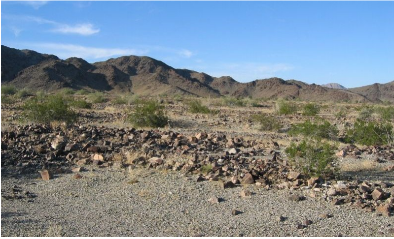
Figure 5. Community Phase 2.1