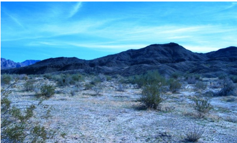
Figure 5. CC3 creosote bush