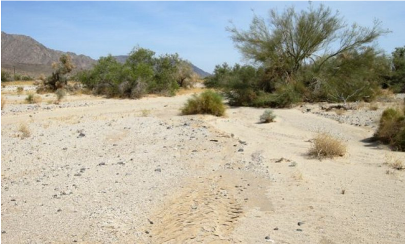
Figure 4. CC1 and CC2 on margins