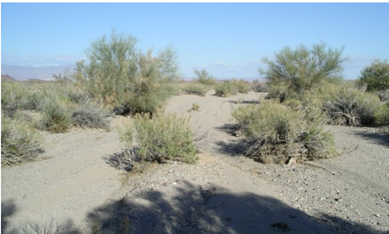
Figure 6. CC2 higher production

This community phase is dependent upon unimpaired hydrologic function and average to above average precipitation. Site specific historical data to determine flood size or frequency is not available. However, historic