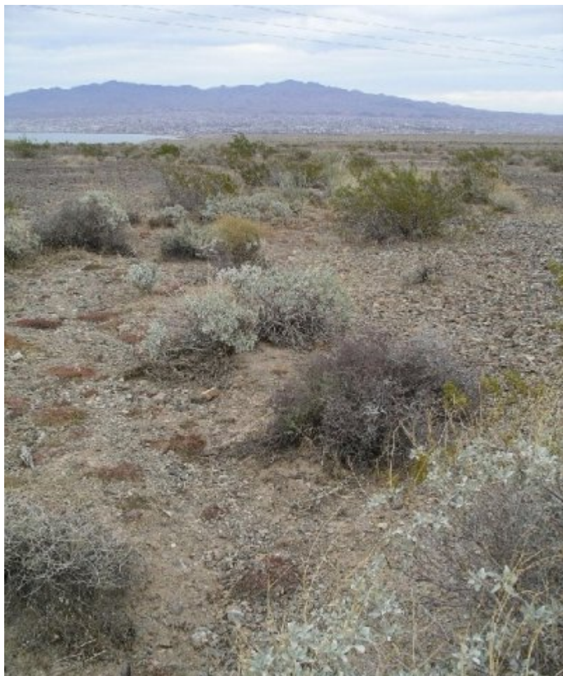
Figure 4. Very Gravelly Wash

This community phase is dependent upon unimpaired hydrologic function and average to above average precipitation conditions. These drainageways are relatively stable and confined. There are two community components associated with this community phase. Community component one is in the most actively flooded region of the drainageway, which is composed of barren sands and gravels. Community component two is adjacent to the active zone in the drainageway and on the sideslopes of the drainageway. Brittlebrush is generally dominant, and creosote bush, white ratany and desert lavender are common secondary shrubs. Although always relatively small, there is variation in the size and shape of these drainageways, ranging from smaller channels with primarily creosote bush, to larger channels with a higher diversity of shrubs. Big galleta ( Pleuraphis rigida ), has low cover in the more defined drainageways. Annual production varies with precipitation, but whitemargin sandmat ( Chamaesyce albomarginata ) and desert Indianwheat ( Plantago ovata ) are usually present with notable cover. Other annuals exist, but were not recorded.