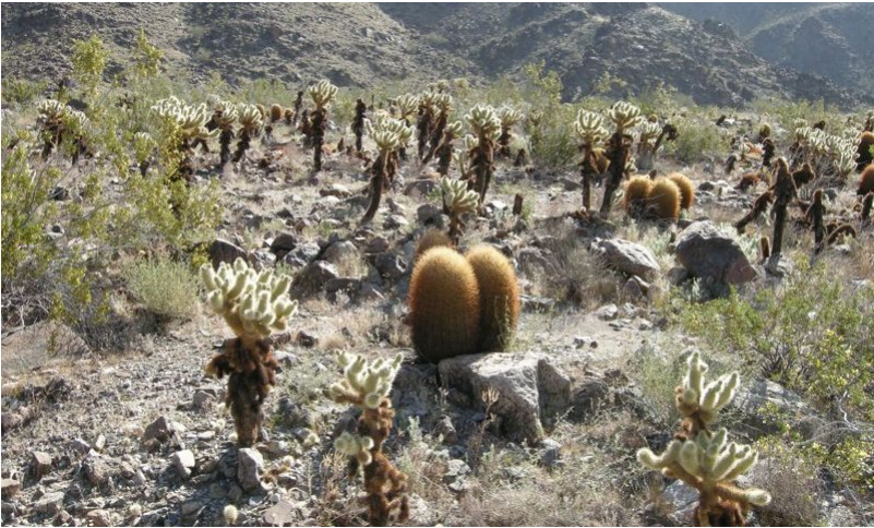
Figure 5. Community Phase 2.1

State 2 represents the current range of variability for this site. Non-native annuals, including Mediterranean grass is naturalized in this plant community, but have not altered the ecological dynamics of this site.