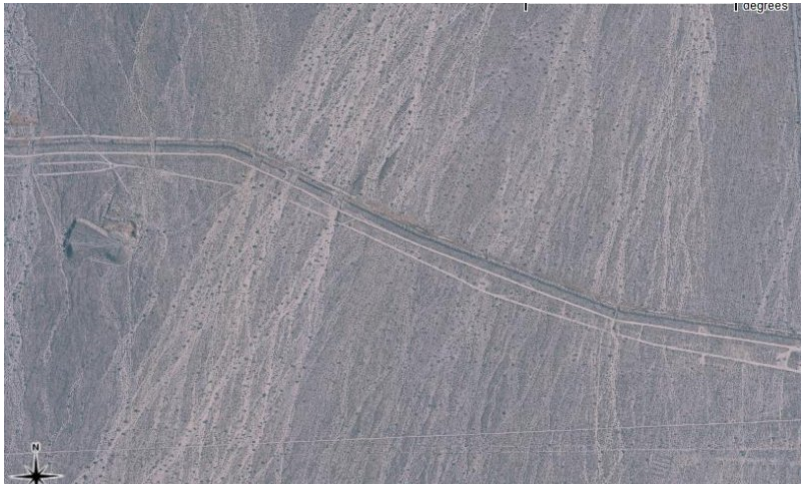
Figure 10. Altered surface flow