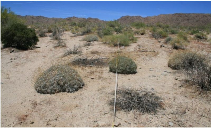
Figure 7. Community Component 3