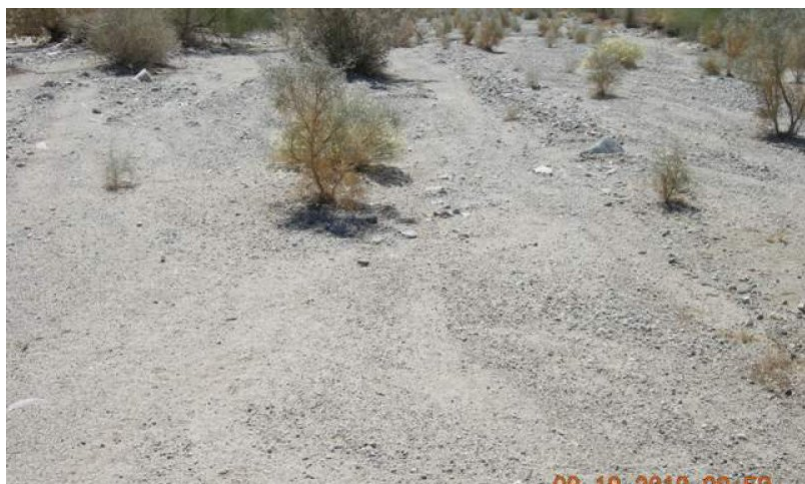
Figure 6. Community Component 1