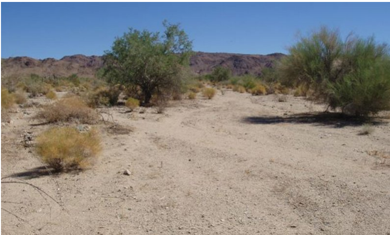
Figure 8. CC2 with Desert Ironwood