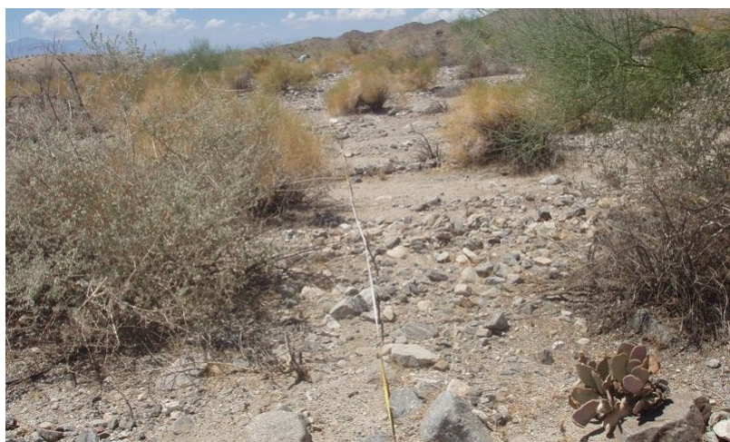
Figure 5. Community Component 2