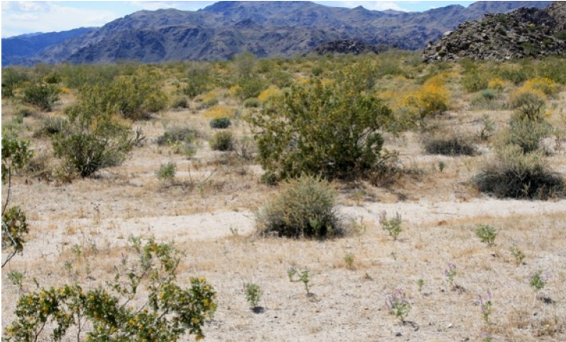
Figure 5. Reference Community

This community phase is dominated by creosote bush and brittlebush. Secondary shrubs are present at low levels, and include burrobush, burrobrush ( Hymenoclea salsola ), Schott’s dahlia, branched pencil cholla ( Cylindropuntia ramosissima ), and ocotillo ( Fouquieria splendens ). Desert ironwood ( Olneya tesota ) and blue paloverde ( Parkinsonia florida ) are generally trace species. Forbs are present in most years, with higher production and diversity during years of higher precipitation. Common species include pincushion flower ( Chaenactis fremontii ), cryptantha ( Cryptantha spp.), buckwheat ( Eriogonum spp.), smooth desertdandelion ( Malacothrix glabrata ), desert poppy ( Eschscholzia glyptosperma ), pygmy poppy ( Eschscholzia minutiflora ), lupine ( Lupinus sp.), birdcage evening primrose ( Oenothera deltoids ), desert Indianwheat ( Plantago ovata ), and chia ( Salvia columbariae ). The non-native annual forb red-stem stork’s bill ( Erodium cicutarium ) is present with up to 6 percent cover, and Asian mustard ( Brassica tournefortii ) is occasionally present with less than 1 percent cover. The non-native Mediterranean grass ( Schismus sp) is often present with low cover.