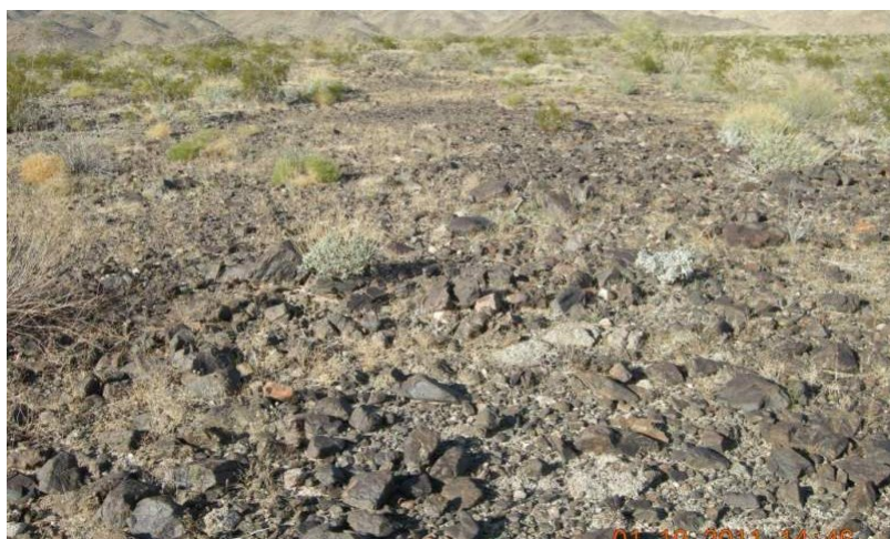
Figure 6. Reference Community

The reference plant community of this ecological site is characterized by a cobbly surface and dominance by creosote bush and brittlebush. Secondary shrubs include: California fagonbush ( Fagonia laevis ), burrobush ( Ambrosia dumosa ), white ratany ( Krameria grayi ), desert lavender ( Hyptis emoryi ), and ocotillo. Cacti include: California barrel cactus, branched pencil cholla, Engelmann's hedgehog cactus, and beavertail pricklypear. Common herbaceous species include: New Mexico silverbush ( Argythamnia neomexicana ), whitemargin sandmat ( Chamaesyce albomarginata ), cryptantha ( Cryptantha sp.), Western Mojave buckwheat ( Eriogonum mohavense ), lupine ( Lupinus sp.), sowthistle desertdandelion ( Malacothrix sonchoides ), curvenut combseed ( Pectocarya recurvata ), desert Indianwheat ( Plantago ovata ), and chia ( Salvia columbariae ). The leguminous trees desert ironwood and blue paloverde may be sparsely distributed across the site. The non-native annual grass Mediterranean grass may be sparsely present.