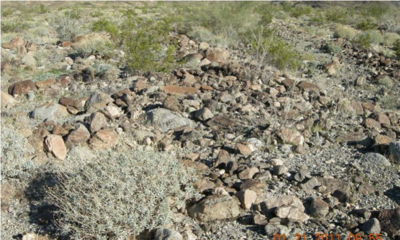
Figure 5. Reference Community

State 2 represents the current range of variability for this site. Non-native annuals, including Mediterranean grass are naturalized in this plant community, but have not altered the ecological dynamics of this site.