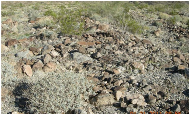
Figure 5. Reference Community