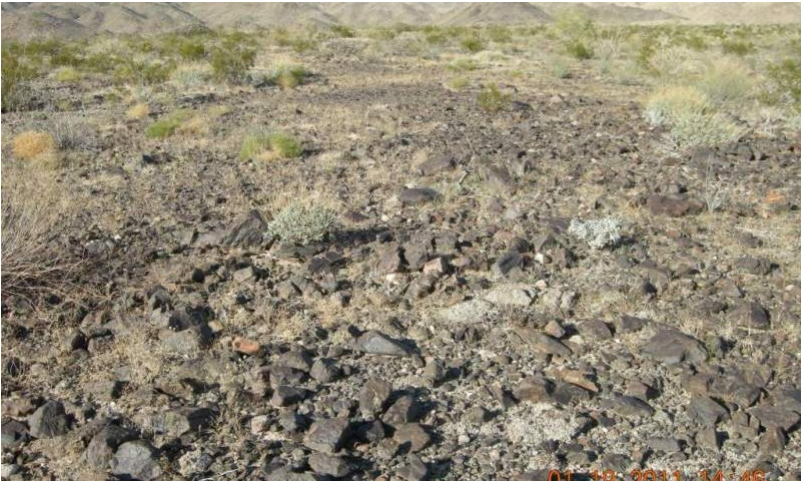
Figure 6. Reference Community

The reference plant community of this ecological site is characterized by a cobbly surface and dominance by creosote bush and brittlebush. Secondary shrubs include: California fagonbush ( Fagonia laevis ), burrobrush ( Ambrosia dumosa ), white ratany ( Krameria grayi ), desert lavender ( Hyptis emoryi ), and ocotillo. Cacti include: California barrel cactus, branched pencil cholla, Engelmann's hedgehog cactus, and beavertail pricklypear. Common herbaceous species include: New Mexico silverbush ( Argythamnia neomexicana ), whitemargin sandmat ( Chamaesyce albomarginata ), cryptantha ( Cryptantha sp.), Western Mojave buckwheat ( Eriogonum mohavense ), lupine ( Lupinus sp.), sowthistle desertdandelion ( Malacothrix sonchoides ), curvenut combseed ( Pectocarya recurvata ), desert Indianwheat ( Plantago ovata ), and chia ( Salvia columbariae ). The leguminous trees desert ironwood and blue paloverde may be sparsely distributed across the site. The non-native annual grass Mediterranean grass may be sparsely present.