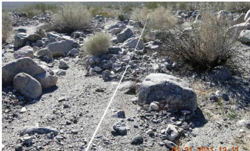
Figure 7. Blue paloverde- Schotts dalea