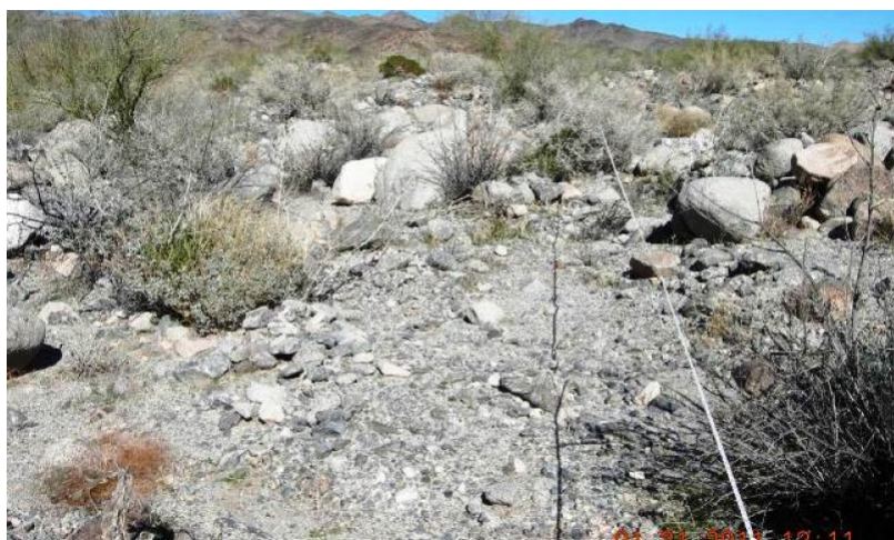
Figure 8. Blue paloverde- Schotts dalea