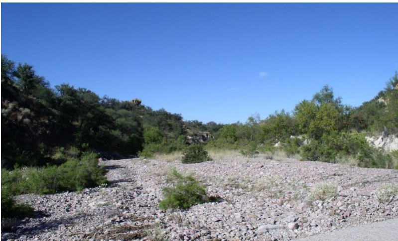
Figure 8. Sandy Bottom, PLWR, POFR 16-20" pz, eroded

This state occurs where the contributory watersheds are destabilized by the interactions of fire, drought and / or continuous grazing. Large amounts of runoff and sediment are delivered to the site causing gully and stream-bank erosion. Channel erosion can deepen floodways and reduce flooding of the stream terraces. Sediment can clog channels causing new channels to cut through floodplains, uprooting trees and removing cover and woody debris. Poorly designed stream crossings, bridges and culverts can cause short reaches of this state in areas immediately downstream.