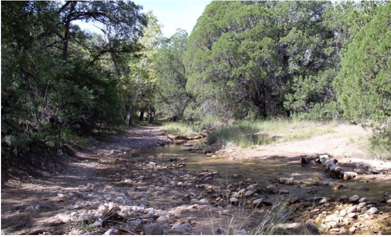
Figure 7. Sandy Bottom, PLWR, POFR 16-20" pz, juniper

This state occurs where shrubby tree species like mesquite, alligator and one-seed juniper, and non-natives like tree of heaven, salt cedar, Chinese elm and Russian mulberry invade and increase to dominate openings in the native tree cover. This can occur in the presence of a seed source for these species and with continuous grazing of the understory vegetation. Once established these species could contribute, as ladder fuels, to the decline of native tree species in wildfires.