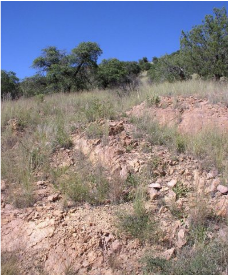
Figure 5. Granitic Hills 16-20" pz. (on rhyolite) RPC

The potential plant community is a diverse mixture of warm and cool season perennial grasses, ferns, forbs, succulents and shrubs. The tree and shrub component is influenced by the sun exposure of the hillslope. The warm exposures (southern slopes) have more shrubs like mimosa and manzanita where the cooler exposures (northern slopes) have more alligator juniper and pinyon. Mexican pinyon only comes into these plant communities in the absence of fire. A tree canopy of 5-15% Mexican live-oak occurs on the site. Most perennial herbaceous species are well dispersed throughout the plant community with 25%-40% canopy cover. A few species, however, occur only under the canopies of trees. Oak species on the site are very tolerant of fire. Naturally occurring wildfires in June-August are an important factor to shaping this plant community. Fire-free intervals ranging from 10-30 years maintain a savanna aspect. In the absence of fire for longer periods, the site gets shrubbier and shrubbier. Heavy grazing and drought can extend fire intervals by removing fine fuels needed to carry fire. The aspect is savanna. Periodic droughts occur and cause significant grass mortality. Droughts in the early 30s and mid 50s, 1975-76 and 1988-89, 1995-96 and 2002 resulted in the loss of much of the grass cover on this site. The site recovers rapidly when average rainfall resumes due to good ground cover of gravels and cobbles.