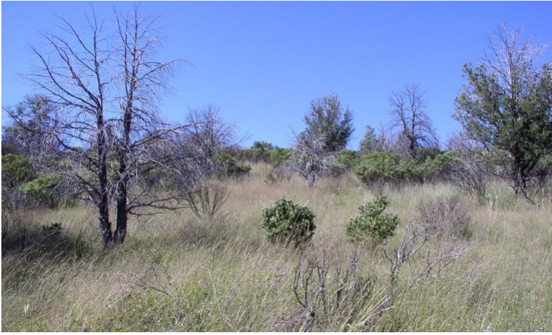
Figure 9. Granitic Hills 16-20" pz., mixed shrubland after burn w/ manzanita

The mixed shrubland plant community occurs where species like mesquite, one-seed and alligator juniper, manzanita, or mimosa species have been introduced to the community or have increased in the absence of fire for long periods of time. Fine fuels still exist, in some years, for fires to carry. Shrubs, however, are well established and re-sprout or re-seed to quickly resume dominance after a fire. Mimosa, sotol, manzanita, ocotillo, juniper and mesquite canopy increases to 5-35%; other shrub and succulents make up 5-20% canopy. The aspect is shrubland with a herbaceous understory.