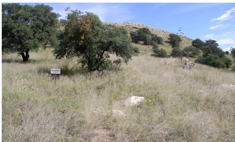
Figure 8. Granitic Hills 16-20" pz. Lehmann lovegrass

This state occurs where non-native grass species like Lehmann, Boer and weeping lovegrass dominate the herbaceous understory. Originally seeded in problem areas for soil stabilization, the seed can be transported by vehicles and animals, both wild and domestic, to move in along roads and trails. Established patches of exotic lovegrasses can expand simply from the species' prolific seed production and germination. Continuous unmanaged grazing removes native perennial grasses by selectively increasing grazing pressure on the natives. Once established, non-native grasses can increase to dominate the site. Tree and shrub species remain in the plant community. Repeated fire tends to increase Lehmann lovegrass on this site at the expense of native species. Herbaceous production in this state can exceed that of the RPC; however, exotic lovegrasses are low in nutritional value (low protein, high indigestible carbohydrates) and generally not preferred by livestock. Considering the steeper slopes found on this ecological site, grazing use in this state will be less than adjacent gentler sloped sites, except during early spring green-up on southerly aspects. Exotic lovegrass seed is very small, making it unavailable as a food for wildlife; a monoculture stand can become too dense for small wildlife movement. This state is very stable. The aspect is savanna.