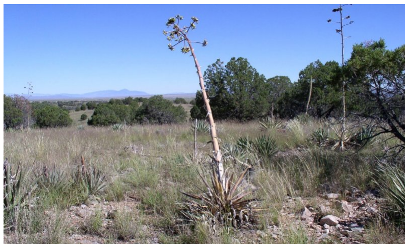
Figure 7. Limestone hills 16-20" p.z., Shrub Dominated State (one-seed juniper)