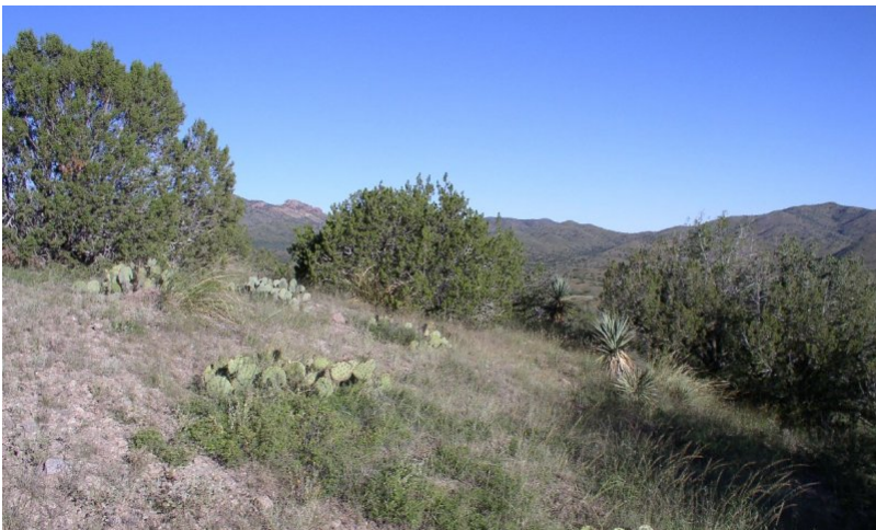
Figure 9. Limy Slopes 16-20" pz. juniper invaded

This state occurs where shrubs like wait-a-bit, one seed juniper and mesquite increase in the absence of fire for long periods of time. Mesquite, whitethorn acacia and Lehmann lovegrass will increase to dominate if their seed is introduced. Yucca like shrubs including sotol, beargrass and soapweed yucca can also increase. Sufficient fine fuels may exist to carry fire but the major shrubs are well established and will re-sprout after fire and quickly assume dominance. The aspect is shrubland.