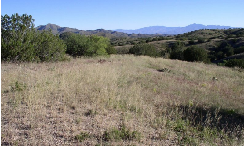
Figure 8. Limy Slopes 16-20" pz. Boer lovegrass

This state occurs where Lehmann or Boer lovegrass has been seeded or has moved onto the site from a nearby seed source. Lehmann can increase to dominate the plant community. Native perennial grasses and forbs are reduced to minor amounts and removed by unmanaged grazing or repeated fire. Herbaceous production in this state can exceed that of the RPC; however, exotic lovegrasses are low in nutritional value (low protein, high indigestible carbohydrates). Also, these lovegrasses are generally less palatable to livestock than native perennial grasses. Livestock grazing use will be minimal with livestock concentrating grazing use on less steep, adjacent sites considering the steeper slopes; livestock will use the non-natives on south slopes during early spring green-up. Exotic lovegrass seed is very fine making it unavailable as a food for wildlife and a monoculture stand can become too dense for small wildlife movement. This state is very stable. The aspect is grassland or savannah when scattered trees are present.