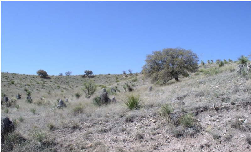
Figure 5. Limy Slopes 16-20" pz. Reference Plant Community

The potential plant community on this site is dominated by warm season perennial grasses with a fair component of cool season perennial grasses and half shrubs. Cool season grasses tend to be clumped on the site and not evenly dispersed in the community. Several species of shrubs, cacti, other succulents and forbs are represented in the plant community. Cool season grasses and preferred warm season mid-grasses can be removed from the plant community by repeated selective grazing or continuous heavy grazing. Less desirable species like red and blue three-awns will then dominate the grass community. Without periodic disturbance, like grazing or fire, perennial mid-grasses can become decadent; then, with less live perennial grass cover, forbs like herbaceous sage and cudweed can increase to dominate the plant community. The aspect is open grassland or savanna when scattered trees are present.