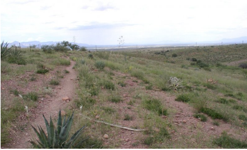
Figure 10. Loamy Slopes 16-20" pz. trailed and eroded

This state occurs where severe soil compaction and trailing has resulted in loss of plant cover and an increase in runoff. Sheet and rill erosion accelerates and the surface (A) horizon is removed faster than it can be replaced by down-slope soil movement and weathering of the ridgetops. When the subsurface argillic (clayey) horizons are exposed, the site has lost its potential productivity. The plant community will shift from warm season plants to cool season plants and the ratio of runoff to infiltration will increase.