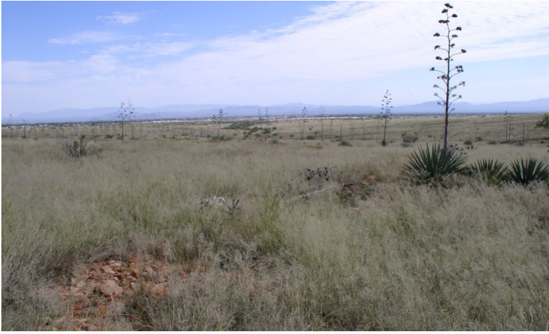
Figure 8. Loamy Slopes 16-20" pz. Lehmann lovegrass

This state occurs where non-native lovegrass species or yellow bluestem, have invaded from adjacent areas or roads and right-of-ways with a seed source. As these species increase to dominate the plant community, native perennial grasses and forbs decrease to remnant amounts. Fire will usually act to increase species like Lehmann lovegrass. The native half shrubs seem to be able to stay in the plant community. It is not known how Agave palmeri fares under this condition.