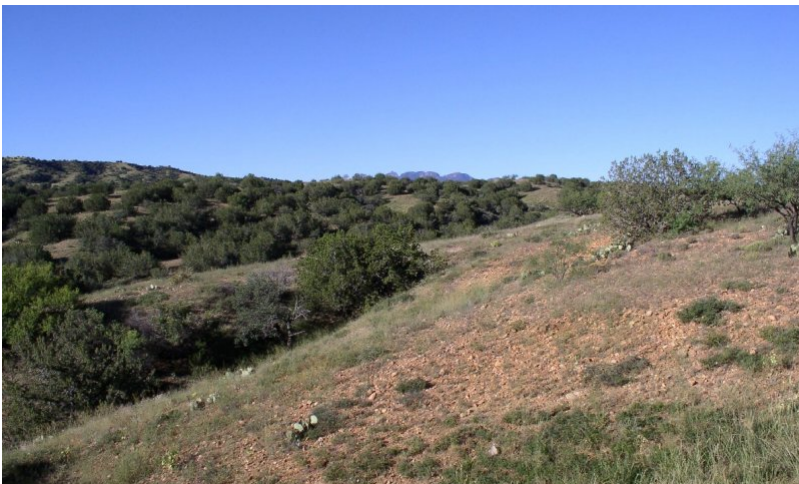
Figure 9. Loamy Slopes 16-20" pz. juniper invaded

This state occurs where mesquite, wait a bit mimosa, one-seed juniper and / or alligator juniper have invaded or increased to dominate the plant community. This occurs in the absence of fire for long periods of time, with continuous grazing and in the presence of a seed source of these species. As canopy levels of trees and shrubs approach 30%, sheet and rill erosion can begin to accelerate.