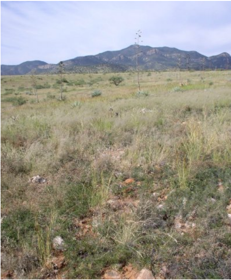
Figure 5. Loamy Slopes 16-20" pz. Agave Palmeri