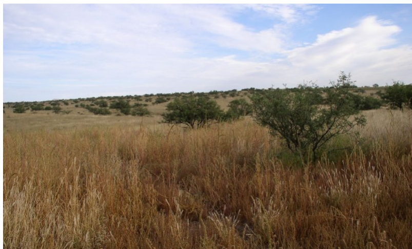
Figure 9. Sandy Loam Upland 16-20" pz. Mesquite

With continuous grazing, a nearby seed source, and in the absence of fire for long periods of time; velvet mesquite, western honey mesquite, alligator juniper and / or one seed juniper can invade and increase to dominate the site. Canopy cover ranges from 1 to 30%. Sheet and rill erosion can begin to accelerate at the higher canopy levels.