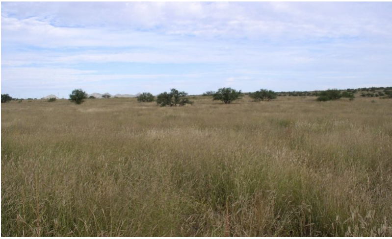
Figure 5. Sandy Loam Upland 16-20" pz. HCPC

The historic native state includes the native plant communities that occur on the site, including historic climax plant community. This state includes other plant communities that naturally occupy the site following fire, drought, flooding, herbivores, and other natural disturbances. The historic plant community represents the natural climax community that eventually reoccupies the site with proper management. The potential plant community on this site is dominated by warm-season, perennial midgrasses. The major perennial species are well dispersed throughout the plant community. Perennial forbs, several species of low shrubs and succulents are well represented in the plant community. The aspect is open grassland to oak-grass savannah. Mesquite and Lehmann lovegrass are at the upper limits of their elevation range, but can increase to dominance on this site, especially with climatic warming. Naturally occurring fires in Jun-Aug are an important factor in shaping this plant community. Fire-free intervals range from 10-20 years. Periodic drought can occur in this LRA and cause significant grass mortality. Droughts in the early 30s, mid-50s, 1975-76 and 1988-89 resulted in the loss of much of the perennial grass cover on this site. This site recovers very rapidly, however, due to the favorable climate prevailing in this sub-resource area and thick, coarse textured soil surfaces.