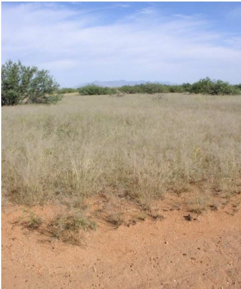
Figure 8. Sandy Loam Upland 16-20" pz. Lehmann lovegrass

This state occurs where African lovegrass species either have invaded from established stands or from direct seeding of these areas. Lehmann, Boer, weeping lovegrass, and in some places the yellow bluestems, are dominant and native perennial grasses and forbs exist only in trace amounts. Cover and production of these species is very high and site stability and hydrologic function are good.