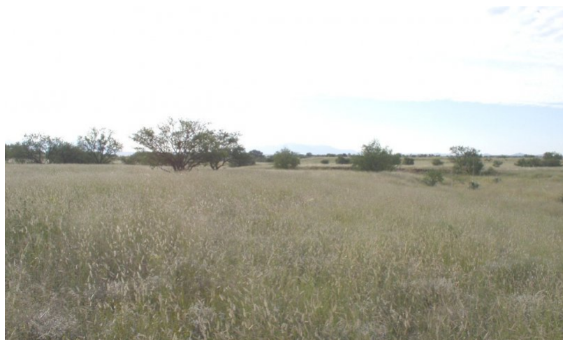
Figure 9. Loamy Swales 16-20" pz. Mesquite

Mesquite and / or juniper has invaded the site in the absence of fire for long periods of time. Shrub canopy ranges from 2 to 15%. Native perennial grasses dominate the under-story. Annuals fluctuate with climate (drought / El Nino). Sediment accumulation around the base of trees protects them from the heat of fires. Non-native perennial grasses like bermuda and Johnson grass can exist in minor amounts.