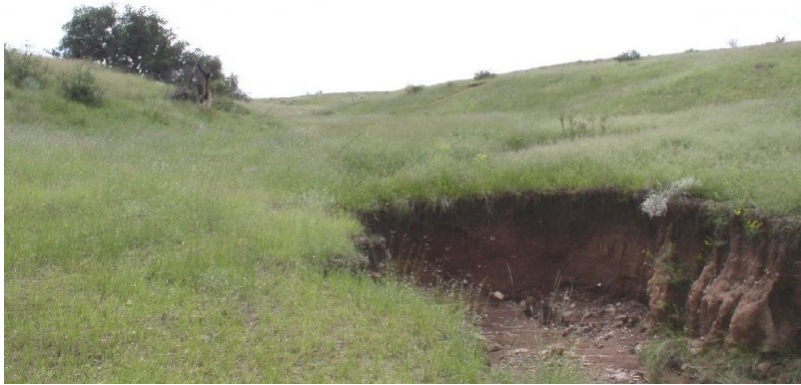
Figure 10. Loamy Swale 16-20" pz., gullied

The interaction of continuous heavy grazing with drought, flood and fire; with or without shrub invasion, can lead to gully formation. Other areas of this state are caused by head-ward gully erosion coming from the down-cutting of major stream systems. The site no longer holds the flood water it receives from adjacent upland areas. The under-story deteriorates to annual forbs and grasses. Other shrubs and cacti can grow in the under-story. Mesquite, juniper canopy ranges from 1 to 35%.