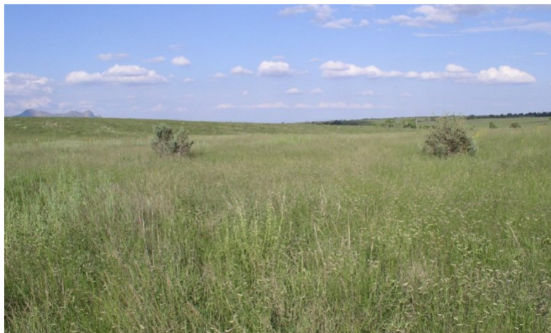
Figure 5. Loamy Swale 16-20" pz., HCPC