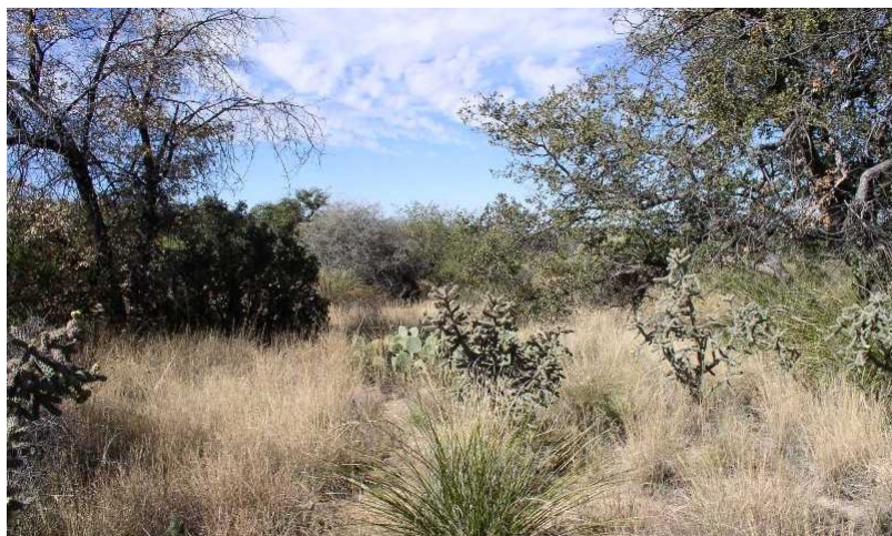
Figure 8. Granitic Upland 16-20" pz. Shrubby

In the absence of fires for long periods of time shrubs like mesquite, mimosa, ocotillo, manzanita and succulents like prickly pear and agave can increase to dominate the plant community. Climatic warming may be driving the increase in wait-a-bit and velvet-pod mimosas. Mature shrubs are fire tolerant and sprout back vigorously after being top killed. As canopy levels approach 25% the site can no longer support much in the herbaceous layer; further limiting the effect and incidence of fire on the plant community.