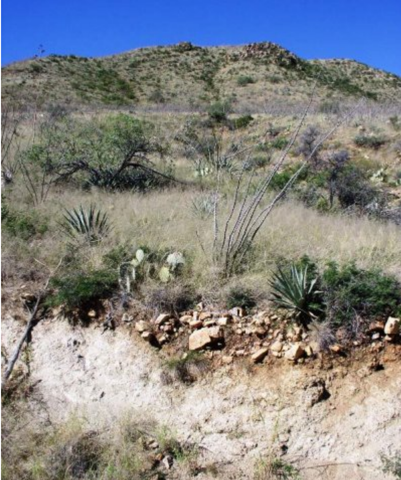
Figure 7. Granitic Upland 16-20" pz. Lehmann lovegrass