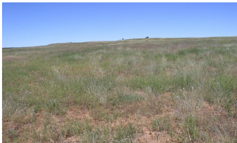
Figure 6. Clayey Upland 16-20" pz., annuals

This state occurs where the cover of native perennial grasses like tobosa and vine mesquite has been removed due the interactions of drought, fire and continuous grazing. Native and non-native annual forbs and grasses dominate the plant community. Production is high due to soil cracking which breaks up soil compaction and results in high, initial, infiltration rates. Non-native annual species include filaree, wild oats, tumbleweed, kochia, yellow starthistle and tumble mustard. When tobosa has been reduced to less than 5% canopy cover on the site it may not be able to come back due to lack of seed in the soil seed-bank.