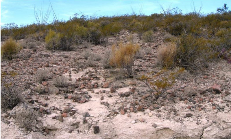
Figure 5. Limy Upland 8-12" pz. soil pit

This plant community is dominated by creosote bush. Annual grasses and forbs are an important part of the plant community in wet seasons. Perennial grasses and forbs are minor components in the potential plant community. Cryptogams are common on this site, often colonizing areas with low gravel covers.