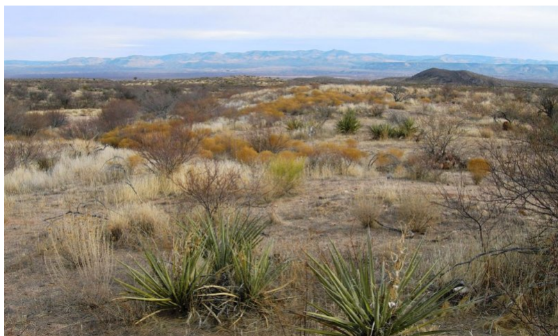
Figure 10. Sandyloam Upland 8-12" pz.

This state occurs where mesquite has increased from 2 to 10% canopy and, with other shrubs, dominates the plant community. Native perennial grasses (suffrutescent) and forbs are absent from the plant community. Native and non-native annuals are very important in the plant community in their respective (wet) seasons.