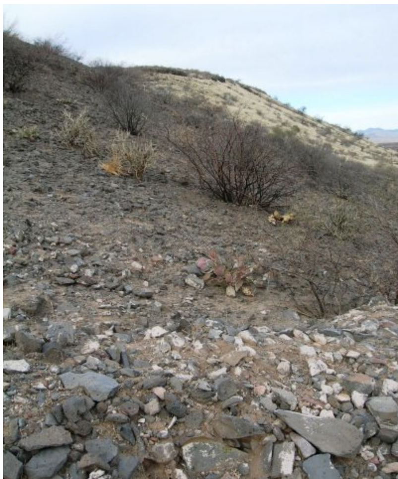
Figure 8. Basalt Hills 8-12" pz., repeated fires

This state occurs where repeated fires have removed the tree and shrub component of the plant community. It occurs near residential areas and along heavily traveled roads where the incidence of fire is high. Native and non-native annual forbs and grasses dominate the plant community.