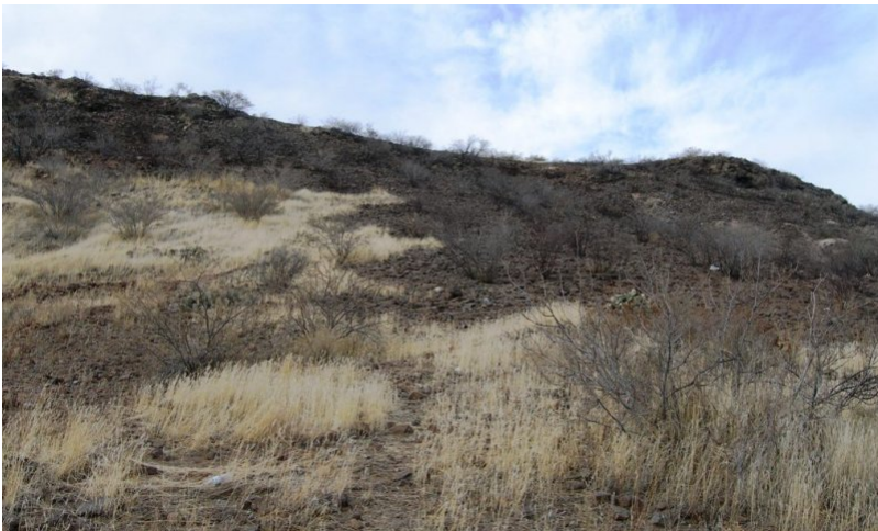
Figure 7. Basalt Hills 8-12" pz., red brome

This state occurs where non-native annual grasses and forbs have increased to dominate the herbaceous layer of the plant community. The native tree and shrub cover is intact. Annual species like red brome, cheatgrass, filaree, purslane and tumble mustard dominate the under-story. Native annuals and perennial grasses and forbs still exist in the plant community but are diminished in cover and diversity.