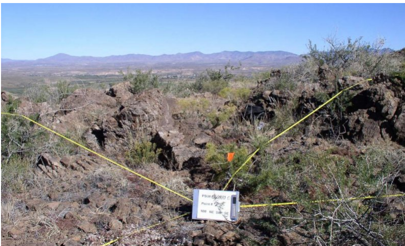
Figure 5. Basalt Hills 8-12" pz., HCPC

The native potential plant community on this site is a mixture of desert trees, shrubs, succulents and perennial and annual forbs and grasses. Shrubs like creosote bush dominate the plant community. Annuals, of both winter and summer types, are very important in their respective seasons in wet years. Perennial grasses fluctuate from 1-2% after prolonged drought to 20% of the plant community during favorable rainfall years.