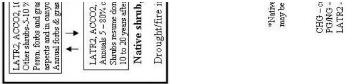
Figure 4. State and Transition, Basalt Hills 8-12" pz.