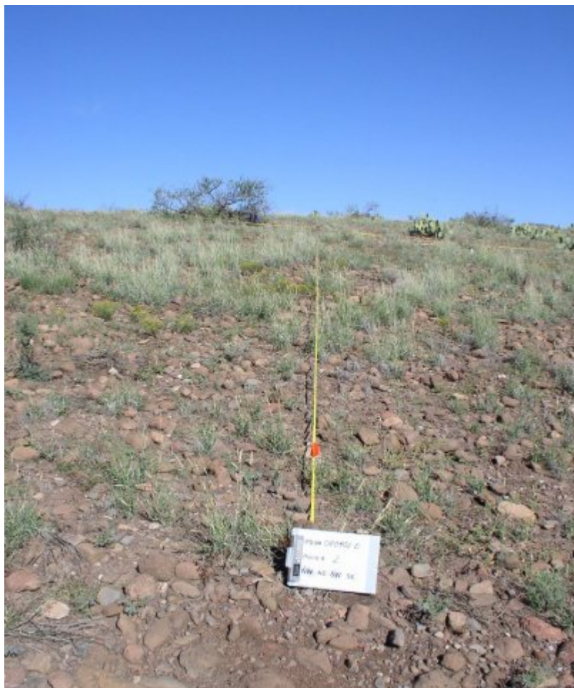
Figure 7. Clayey Slopes 12-16" pz. mesquite, native grass

Mesquite invades or increases in the absence of fire for long periods of time. Other shrubs like prickly pear, snakeweed and burroweed can increase. Native perennial grasses still dominate the herbaceous layer; especially tobosa and curly mesquite.