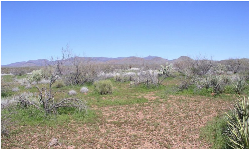
Figure 7. Clayloam Upland 12-16" pz. mesquite, shrubs, annua