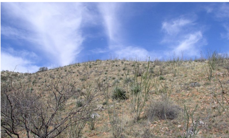
Figure 8. Granitic Hills 12-16" p.z. Lehmann lovegrass invasi