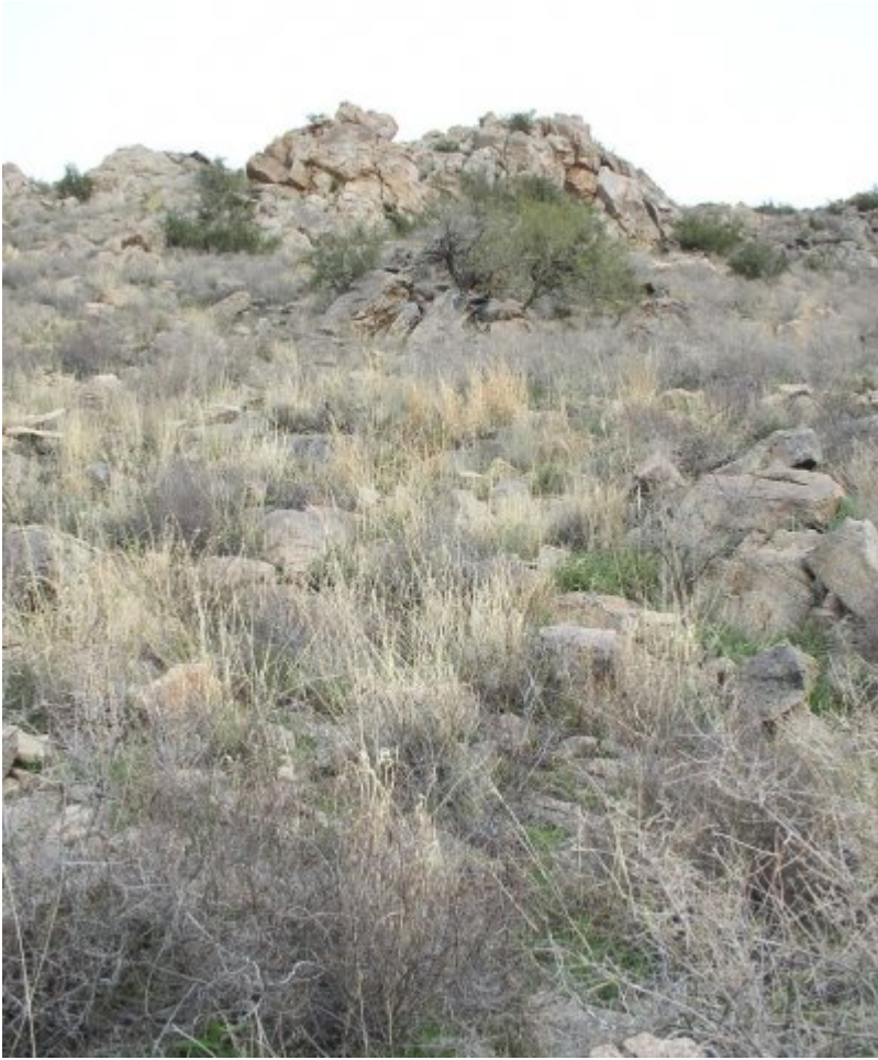
Figure 5. Granitic hills 12-16" pz. HCPC

The potential plant community on this site is dominated by warm season perennial grasses. Several species of low shrubs are well represented on the site, but the aspect is grassland dotted with shrubs and cacti. Larger species of shrubs are concentrated at the edges of rock outcrop areas and in canyon bottoms. Most of the grass and low shrub species are well dispersed throughout the plant community. In the absence of wildfire and/or with overgrazing, shrubs increase to dominate the plant community. Well developed gravel and cobble covers protect the soil from erosion and protect forage species from heavy use. Natural fire was an important factor in development of the potential plant community. Natural fire frequencies were about once every ten years. Fires helped maintain a balance between grasses, forbs and shrubs. With continuous heavy grazing palatable forage species diminish in the plant community and can be replaced by shrubs and succulents. Areas of rock outcrop are little grazed and hold remnant perennial forage species to help reseed the slopes below once grazing is managed. The plant community described for the HCPC is at a midpoint in its fire free interval (5 to 7 years after fire).