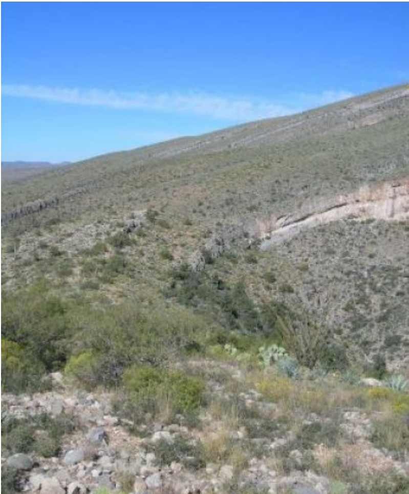
Figure 5. Limestone Hills 12-16" pz. HCPC

The potential plant community on this site is dominated by warm season perennial grasses. Several species of shrubs are well represented on the site. Shrubs can be in concentrations at the edges of rock outcrops and in canyon bottoms. Most of the grass and shrub species are well dispersed throughout the plant community. A few species (black grama, New Mexico feathergrass, amole, sandpaper bush and mariola) grow in patches which vary in size and are not well dispersed over larger areas of the site. In the absence of wildfire and/or with overgrazing, shrubs increase to dominate the plant community. Well-developed gravel and cobble covers protect the soil from erosion and help protect forage species from heavy utilization. The large amount of rock outcrop on the site tends to magnify water received by adjacent soil areas. Natural fire was a factor in the development of the potential plant community. The frequency of natural fire on this site was about once every ten years. Fires burned May through August.