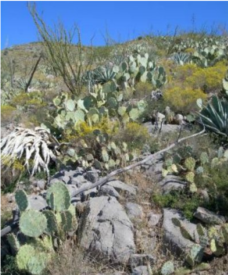
Figure 8. Limestone Hills 12-16" pz. shrubby state

This state occurs where shrubs like whitethorn, mesquite, creosote bush, ocotillo, sandpaper bush, and mariola have increased to dominate the community in the absence of fire for long periods of time. Succulents like shin dagger, sotol, agave and prickly pear can also increase on the site. Although the site may burn after an exceptionally wet summer the shrubs are well established and some species re-sprout and re-assume dominance.