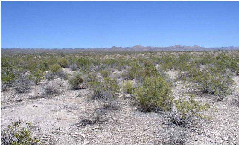
Figure 5. Limy Upland 12-16" pz. HCPC

The potential plant community on this site is a diverse mixture of desert shrubs, half shrubs and perennial grasses and forbs. Most of the major perennial grasses on the site are well dispersed throughout the plant community. Black grama occurs in patches which are small in size and appear to be well dispersed over large areas of the site. The aspect is shrub-land. Cryptogam cover (moss, lichen) can be considerable in the plant community, but diminishes as the surface cover of gravel increases. With continuous heavy grazing, the palatable perennial grasses and forbs are replaced by increases in the large woody perennials (creosote bush, white thorn, and tar bush). Natural fire may have been important in maintaining a balance between herbaceous and woody species on the site, but fire free intervals were much greater than those of more productive sites, due to the length of time needed for fuels to accumulate. Also, fuel continuity is poor in areas of this site due to slope and aspect. In addition, the major perennial grasses; bush muhly and black grama, have shrub-like characteristics (perennial culms and branching), and accumulate much old dead material and may take several years to recover to pre-fire conditions. North aspects have more perennial grass than south aspects. Shrubs will resume dominance within ten years after fire.