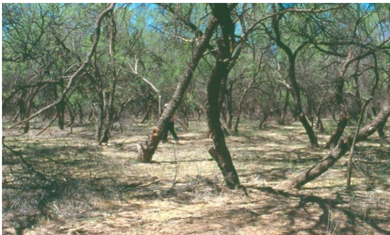
Figure 4. Loamy Bottom, PROSOP 12-16" pz. HCPC