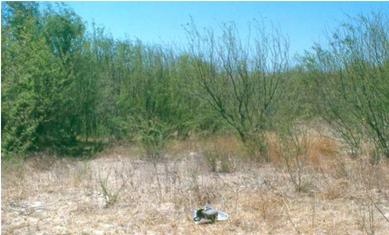
Figure 6. Loamy Bottom, PROSOP 12-16" pz. thornscrub

This state occurs where mesquite has been cleared for cultivation and subsequently abandoned; or where mesquite has been cut for fuel-wood. The water table is intact. Mesquite re-growth and / or sprouts form a thorn-scrub with a 25-50% canopy 15 years after wood harvest or clearing that leaves root systems alive. Mesquite will take much longer to re-colonize areas that have been cleared and cultivated. Mesquite seeds need to be introduced to these areas and new plants will take 15 to 20 years for roots to reach the water table. It will take from 50 to 100 years with no further mesquite harvest for trees to reach maturity on the site.