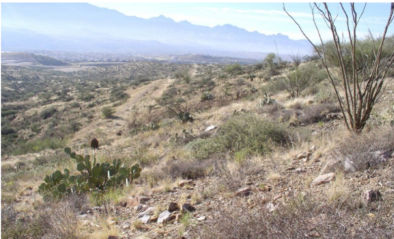
Figure 8. Loamy Slopes 12-16" p.z. shrubby state

Mesquite increases or invades in the absence of fire for long periods of time. Other shrubs like prickly pear, blue paloverde, ocotillo, cholla, snakeweed and brittlebush can increase to make the site appear shrubby. Native perennial grasses and forbs still dominate the herbaceous layer of the plant community.