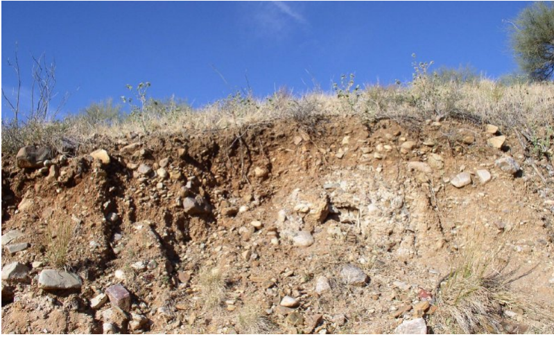
Figure 9. Loamy Slopes 12-16" pz. Selevin soil profile

The interactions of fire, drought and continuous grazing act to remove perennial grasses from the plant community. Annuals, both native and non-native dominate the herbaceous layer of the plant community. The shrubby component of the community remains unchanged. Some soil compaction has occurred and sheet erosion has accelerated.