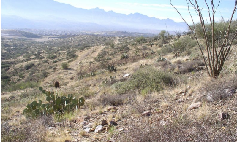
Figure 8. Loamy Slopes 12-16" p.z. shrubby state

Mesquite increases or invades in the absence of fire for long periods of time. Other shrubs like prickly pear, blue paloverde, ocotillo, cholla, snakeweed and brittlebush can increase to make the site appear shrubby. Native perennial grasses and forbs still dominate the herbaceous layer of the plant community.