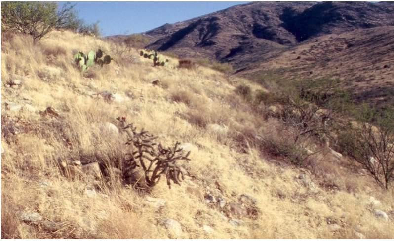
Figure 5. Loamy Slopes 12-16" pz. HCPC

The potential plant community of this site is dominated by warm season perennial grasses with a variety of shrubs, succulents and forbs being well represented. The major perennial grasses are well dispersed throughout the plant community. The aspect is shrub dotted grassland. With continuous heavy grazing, palatable perennial grasses are removed and species like mesquite, catclaw acacia, mimosa, ocotillo, snakeweed, burroweed and prickly pear increase to dominate. Natural fire may have been an important part in the development of the potential plant community. With steep slopes and heavy textured horizons near the soil surface, this site becomes an ineffective user of intense summer rainfall if the perennial grass cover is depleted. The potential of the site to produce grass is reduced as tree canopy increases. The site can produce effective herbaceous covers with up to 5-10% tree canopy. Fire and drought interactions can deplete the perennial grass cover. When this is followed by a wet spring tremendous stands of annual forbs like goldeneye, poppy and lupine can result.