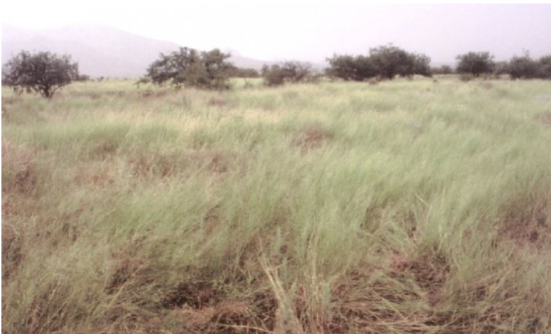
Figure 9. Sandy Loam Deep 12-16" pz. Lehmann invasion

Mesquite has increased in the absence of fires for long periods of time to canopy levels of 10%. Lehmann lovegrass has invaded from seeded areas and is dominant in the under-story. Remnant native perennial grasses diminish over time. Native annual forbs and grasses diminish in the soil seed-bank over time. Fire may act to increase dominance of lehmann lovegrass at the expense of native perennial grasses, but may allow native annual species a chance to make seed and persist in the seed-bank. Some soil compaction has occurred due to livestock traffic, but hydrologic relationships have not been impaired.