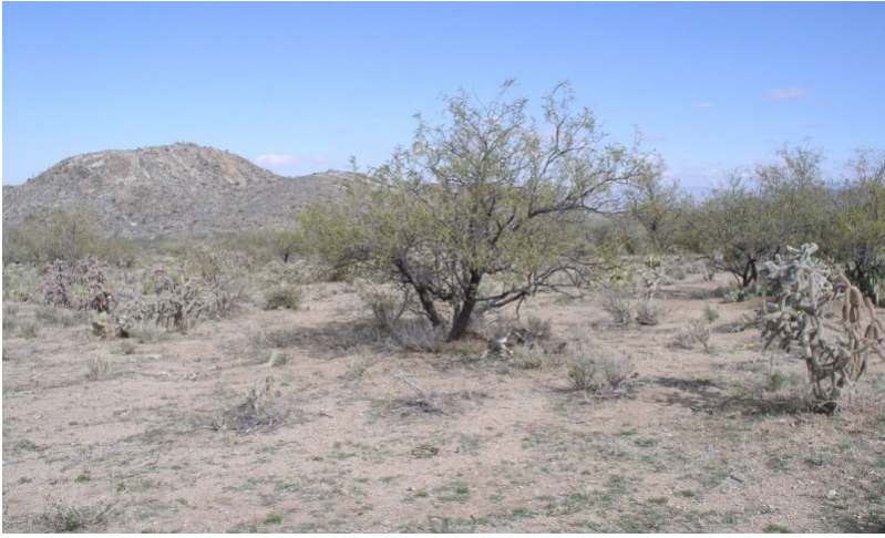
Figure 10. Sandy Loam Deep 12-16" pz. dense mesquite, eroded

Mesquite continues to increase in the absence of fire up to canopy levels of 25%. Other shrubs and succulents like prickly pear and cholla, dominate the under-story. Remnant perennial grasses exist only in the protection of cacti and shrubs. Occasional fires may burn after extremely wet seasons, but mesquite is well established and sprouts back to a thorn-scrub stage. Soil compaction and reduced herbaceous cover has resulted in sheet, rill and gully erosion on the site. Hydrologic relationships have been impaired and runoff is increased.