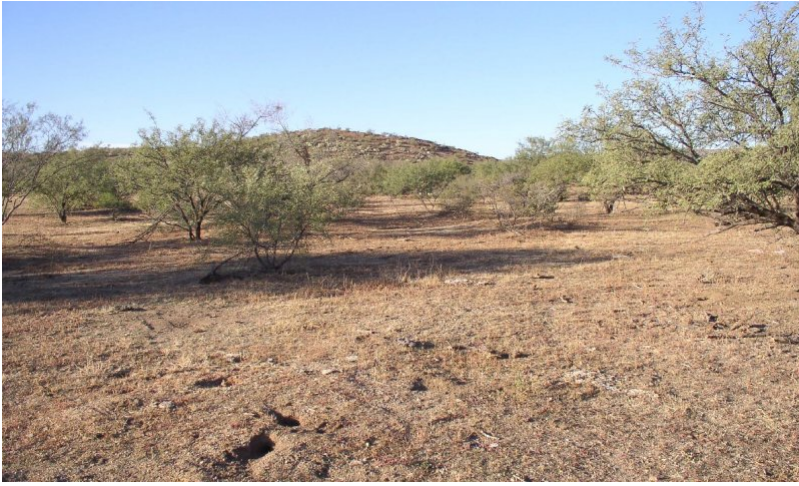
Figure 8. Sandy Loam Deep 12-16" pz. mesquite, annuals

Mesquite is dominant with canopy levels of 10 to 15%. Native and non-native annual forbs and grasses, both cool and warm season, dominate the under-story. Burroweed and snakeweed cycle with climate, but are always important in the under-story. Native perennial grasses are gone due to the interactions of drought, fire and continuous heavy grazing. Usually, soil compaction and the loss of herbaceous cover have resulted in sheet, rill and gully erosion on the site. Hydrologic relationships have changed to increase the amount of runoff.