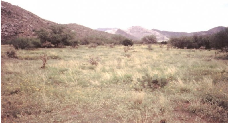
Figure 4. Sandy Loam Deep 12-16" pz.

The potential plant community on this site is dominated by warm season perennial grasses. The major perennial grass species on the site tend to be well dispersed throughout the plant community. Several species of half-shrubs are well represented in the plant community. The aspect is grassland with occasional clumps of desert hackberry, catclaw acacia or mesquite. With continuous heavy grazing, palatable perennial grasses are removed from the potential plant community and species such as Rothrock grama, mesa threeawn, and spidergrass increase. In areas where burroweed dominates the plant community the potential production of perennial mid-grasses is equal to the present production of burroweed once it is removed from the plant community. Even with low plant cover, these soils produce very little runoff and have very low erosion rates. Some soils are sandy textured but have enough coarse fragments that they are not subject to wind erosion. Naturally occurring wildfires (June through August) were important in the development of the potential plant community, and helped maintain a grassland aspect. Hydrologic relationships are good with very little runoff in most years due to coarse textured soils, high plant and litter cover and low soil bulk densities.