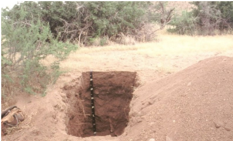
Figure 7. Sandy Loam Deep 12-16" p.z. Combate soils

Mesquite increases in the absence of fire for long periods of time. Native perennial grasses maintain dominance, with good grazing management, and mesquite canopy levels up to 10%. Burroweed fluctuates in the plant community with climate, but never becomes dominant. Cholla and prickly pear can cycle through the plant community. Some soil compaction has occurred due to livestock traffic, but hydrologic relationships have not been impaired.