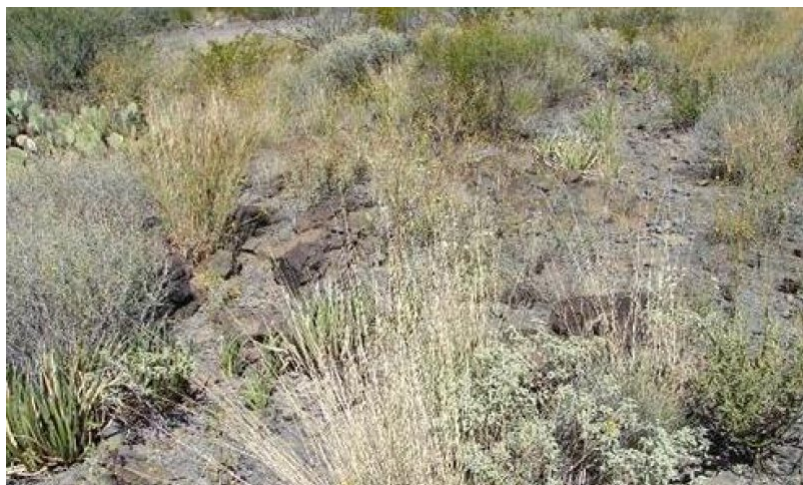
Figure 5. 1.1 Shrubs/Mid and Shortgrass Community