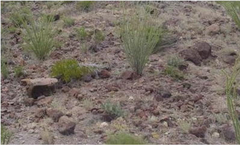
Figure 8. 1.2 Shrubs/Shortgrass Community

The Shrubs/Shortgrass Community (1.2) is the result of both overgrazing by livestock and drought. Overgrazing initially reduces the most palatable and deeper rooted midgrasses such as tanglehead, bush muhly, and Chino grama. Shallow rooted shortgrasses such as slim tridens, fluffgrass, and false grama remain stable and in some cases increase depending upon available resources. Competitive woody plants such as creosotebush begin to increase at the exclusion of other vegetation. Community appearance is slightly sparser. Exposed areas of surface gravels become evident due to displaced plants and decreased litter. Most of the climax perennial forbs persist. Prescribed grazing and some woody plant control can help prevent this community from crossing a compositional and functional threshold and into a naturally nonreversible and stable Shrubland State (3). A transition back towards HCPC, or a similar community, will require prescribed grazing and protection from any unnatural disturbance due to the inherently slow recovery rates within the Chihuahuan Desert.