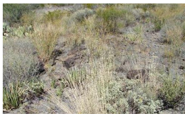
Shrubs/Mid and Shortgrass Community