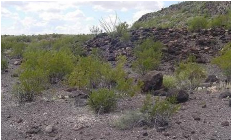
Figure 11. 2.1 Shrubland Community

The Shrubland State is the result of excessive overutilization of plant resources. Drought conditions will only worsen the health of the site. Sparse woody plants, specifically creosotebush, dominate the Shrubland State with few shortgrasses and forbs. Lack of sufficient herbaceous cover exposes the dark surface fragments creating an inhospitable environment for plant seedlings to survive. Runoff is rapid with decreased infiltration. Surface fragments, to some degree, stabilize the soil surface. The Shrubland State is located on many of the lower foothills that have historically been most accessible to livestock. Due to climate, shallow soils, geology, and altered hydrology, this state does not have the potential to return to the Mixed Shrub/Grass State even with prolonged deferment of grazing and woody plant control.