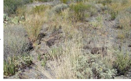
Shrubs/Mid and Shortgrass Community

Prescribed Grazing, Brush Management, and No Droughts can revert back to Shrubs/Mixed Grass Community.