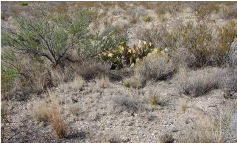
Figure 7. 1.2 Creosotebush – mixed shrubs / shortgrasses

A combination of severe grazing and drought transitions the reference plant community to this plant community. Overgrazing will begin to reduce the most palatable midgrasses, halfshrubs, and forbs. Non-palatable plants such as creosotebush, pricklyleaf dogweed, lechuguilla, and fluffgrass will increase. Isolated midgrasses are still present and can potentially increase with prescribed grazing and favorable rainfall. Soil erosion is accelerated compared to the reference community mainly because in the decrease of grass cover and litter. Surface rock fragments help lessen the impact of erosion to some degree. Prescribed grazing and a series of wet years will help maintain the current plant community and can potentially help return the community to an assemblage similar to the reference community.