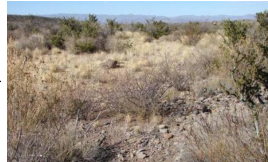
Mixed Shrubs / Diverse Mid and Shortgrasses

Prescribed grazing and favorable rainfall can help restore the more palatable midgrasses.