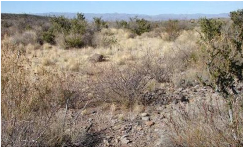
Figure 4. 1.1 Shrubs / Midgrass Community