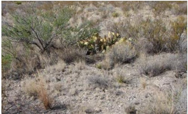
Mixed Shrubs / Shortgrasses – Isolated Midgrasses