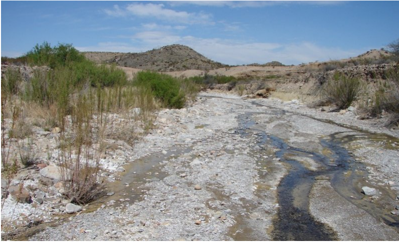
Figure 10. Arroyo channel with riparian vegetation