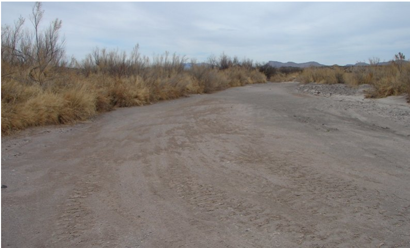
Figure 11. Arroyo channel