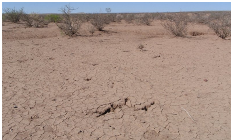
Figure 26. Bare ground/shrubs

This plant community is the result of prolonged and extensive overutilization of plant resources by livestock. Western honey mesquite and or other shrubs have encroached on the site, most likely facilitated by cattle. Bare ground ranges from 50-90 percent. Few isolated tobosa plants are present. Annual grasses and forbs dominated following rain events. This plant community is uncommon on broad basin floors. When it does occur on basin floors it is usually near high use or staging areas such as near stock pens, feeding areas, or sources of drinking water. This community phase can be more common when the site occurs on more narrow drainageways. The site can be susceptible to toxic plants such as inkweed and western bitterweed. In some areas, annual broomweed is also known to dominate this community following rains. The seeds of annual broomweed, a native forb, are a highly desirable food source for quail but of no valuable to livestock.