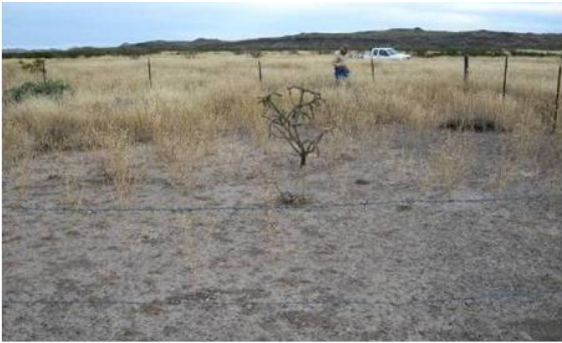
Figure 24. Bare ground/annuals

This plant community is the result of prolonged and extensive overutilization of plant resources by livestock. Often, hydrologic alterations (diversions, dams, stock tanks, roads) also play a role in developing this community phase. Annual forbs and grasses dominate with isolated shrubs and grasses. The community typically occurs near high use or staging areas such as near stock pens, feeding areas, sources of drinking water, near water dams and diversions, or on abandoned cropland. The site can be susceptible to toxic plants such as inkweed and western bitterweed. In some areas, annual broomweed is also known to dominate this community following rains. The seeds of annual broomweed, a native forb, are a highly desirable food source for quail but of no value to livestock. A combination of deferred livestock grazing, rangeland restoration treatments, and favorable rainfall over several decades can potentially facilitate grass recolonization. The presence of nearby surface water diversions or stock ponds can potentially affect recovery efforts by reducing the amount of run in water.