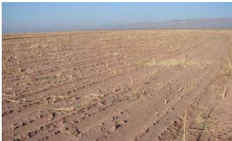
Figure 20. Irrigated cropland

This community is created by land clearing and plowing. Cultivated cropland and pastureland is a common land use practice only if irrigation is available. Abandoned crop or pastureland will eventually transition to the Bare Ground/Annuals State (4).