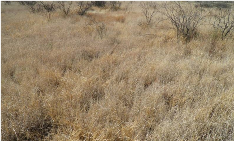
Figure 13. Post-fire plant community