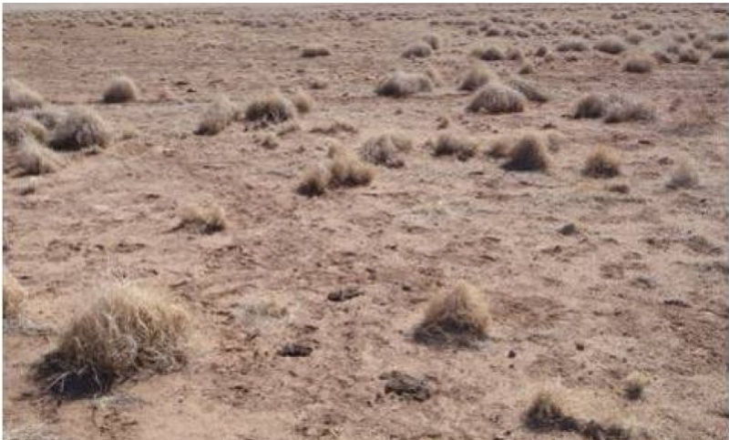
Figure 23. Bare ground/isolated tobosa