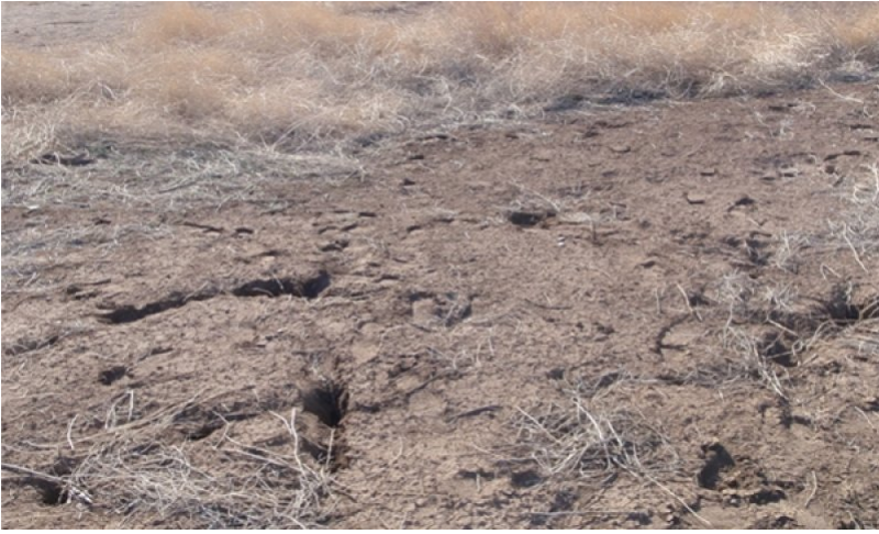
Figure 21. Bare ground/annuals