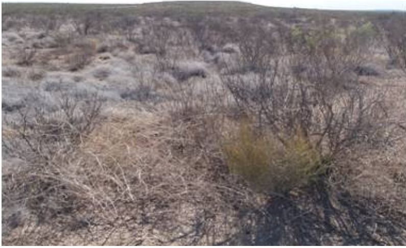
Figure 15. Tobosa/shrubs