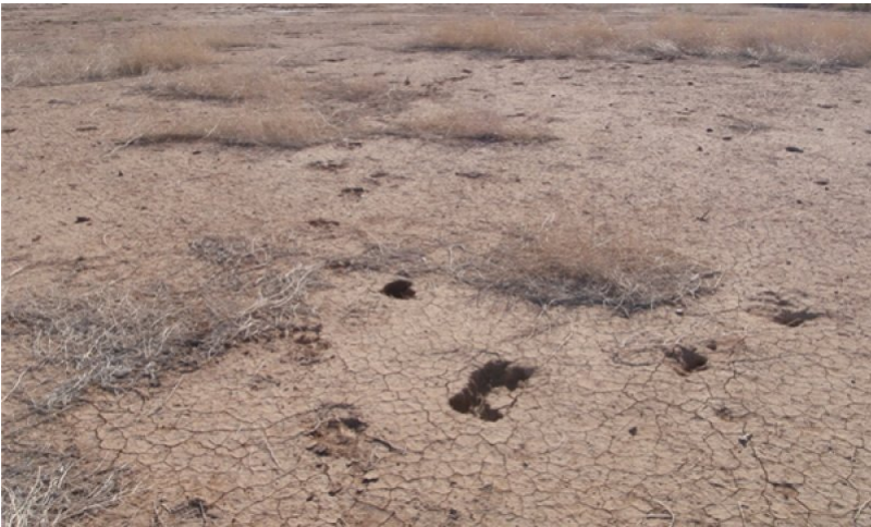
Figure 22. Bare ground/annuals