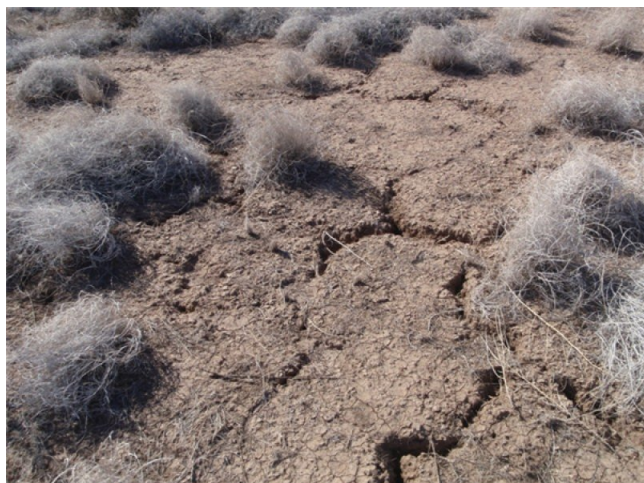
Figure 7. Natural cracks in the soil result from the high sh

The site consists of very deep, moderately well drained, slowly permeable soils formed in clayey alluvium weathered from igneous bedrock and/or sedimentary materials. Depth to bedrock is greater than 72 inches. The fine textured soils allows for increased water holding capacity. However, increased clay also makes small precipitation events ineffective as water does not penetrate deeply, but is retained near the surface where it is subject to evaporation. The site includes two Vertisols (Verhalen and Dalby soils) and one Mollisol (Phantom) with vertic properties. These clay rich soils shrink and swell with changes in soil moisture resulting in gilgai micro-relief in some areas. These are often seen as cracks or holes on the surface which extend to depths of 20 inches or greater. These cracks allow water to infiltrate deep into the soil profile. These soils have been mapped in Culberson, Hudspeth, Presidio, Jeff Davis, Brewster, Pecos, and Reeves Counties.