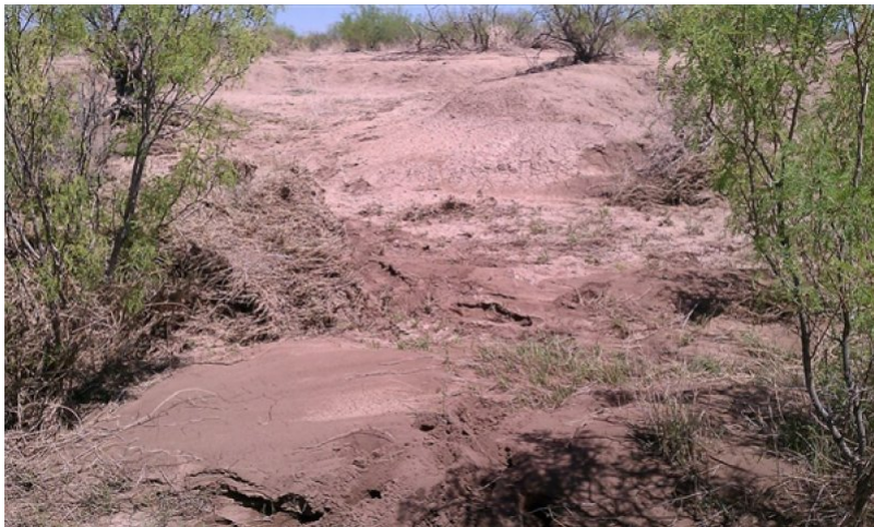
Figure 28. Eroded