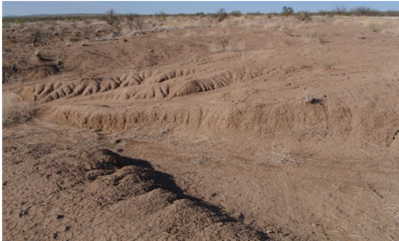
Figure 27. Eroded