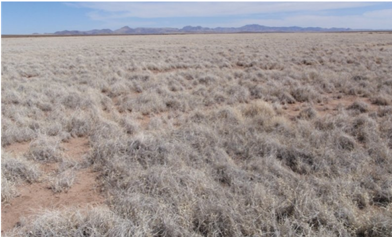
Figure 10. Tobosa grassland