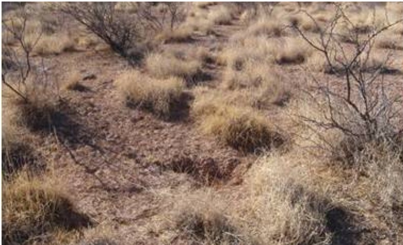
Figure 16. Tobosa/shrubs