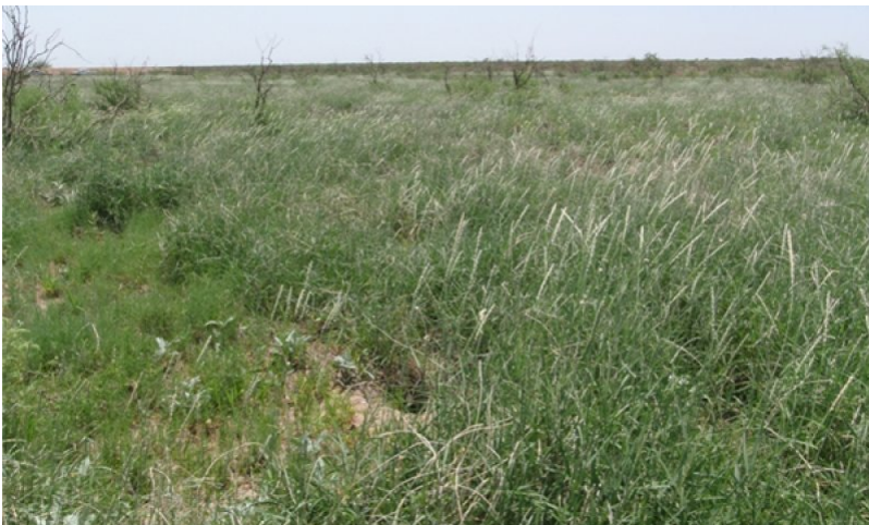
Figure 14. Post-fire plant community

This community phase is a post-fire plant community. Tobosa is very resistant to fire mortality (Innes 2012). Tobosa may increase, decrease, or remain unaffected by fire depending upon soil moisture and plant condition at the time