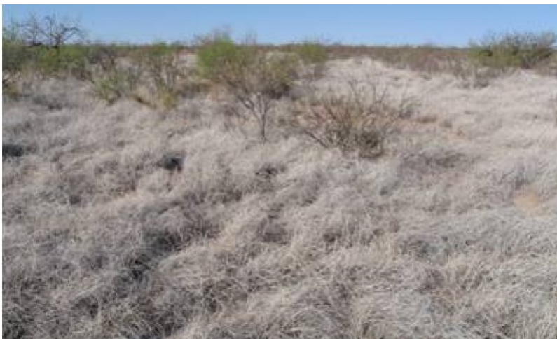
Figure 17. Tobosa/shrubs

This plant community is characterized by at least 10 percent canopy cover of shrubs. Past land use, primarily overgrazing facilitated the encroachment of shrubs such as western honey mesquite. Current land use, however, has allowed the recovery of mostly tobosa and other subdominant grasses. Tobosa cover ranges from about 50-75 percent. Other grasses such as burrograss, alkali sacaton, sideoats grama are typically less than 5 percent cover. Clay Flats occurring within narrow drainageways are more susceptible to have shrub encroachment than sites occurring on wide basin floors. Other shrubs occurring in this phase include lotebush, agarito, ephedra, catclaw acacia, and pricklypear. With adequate fine fuels, prescribed fire can be used as a management tool in this phase. The encroachment of shrubs into desert grasslands may act as a corridor for a diversity of bird species historically not associated with desert grasslands to occupy or move through an area, increasing vulnerability to nest predation (Mason, et al 2005).