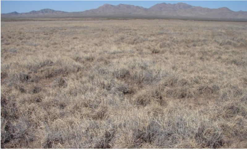
Figure 9. Tobosa grassland