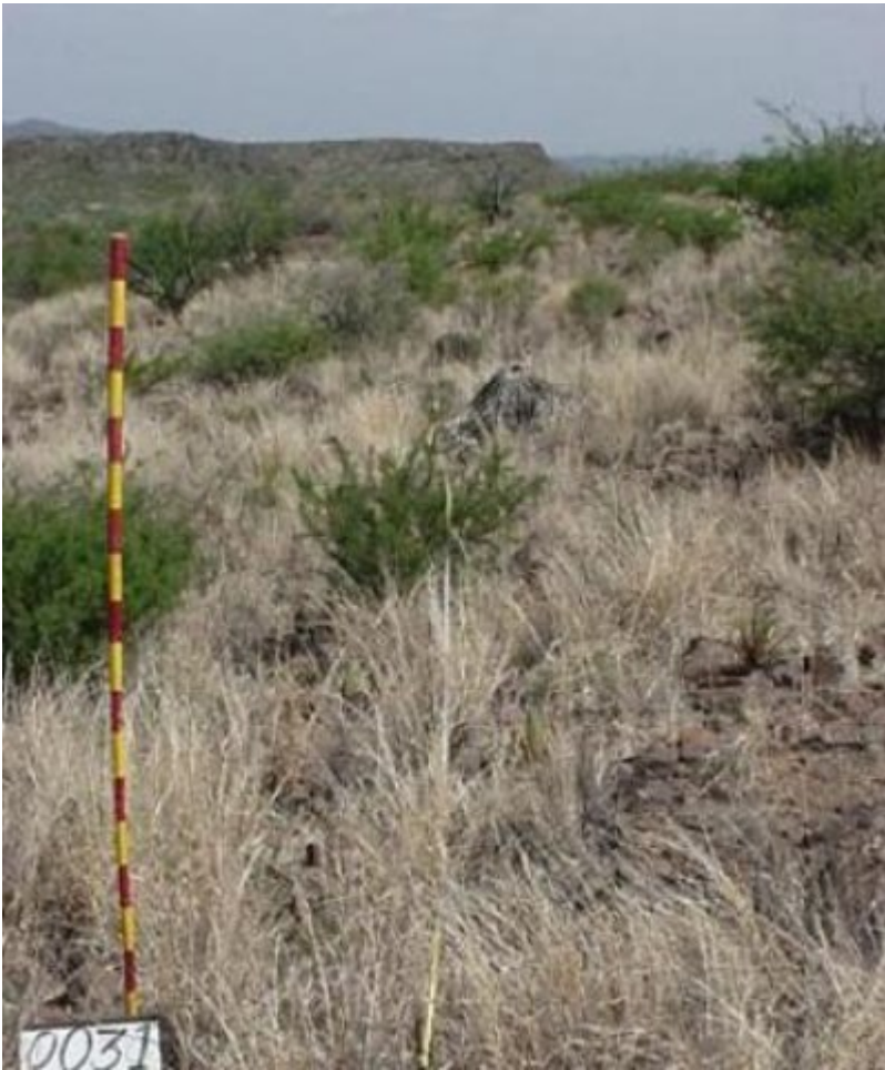
Figure 5. 1.1 Mid & Shortgrass/Shrub Community