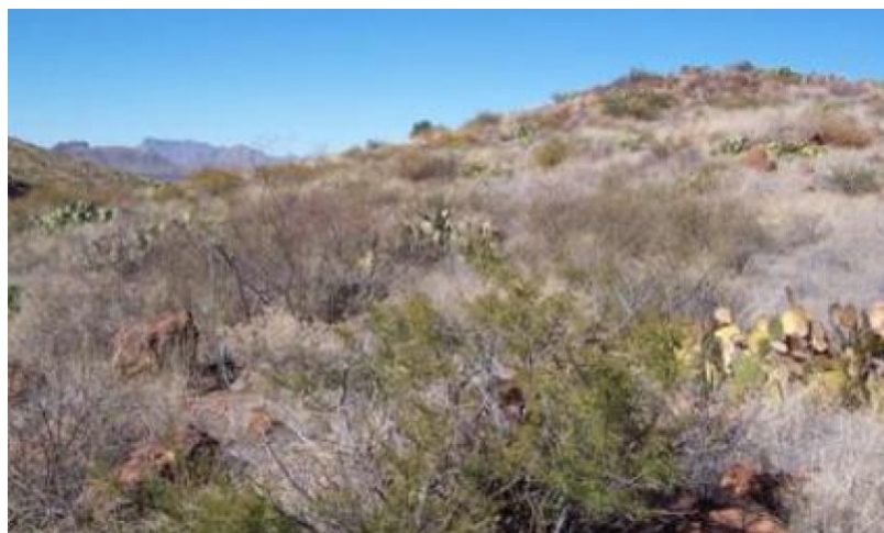
Figure 8. 2.1 Shrub/Shortgrass Complex Community