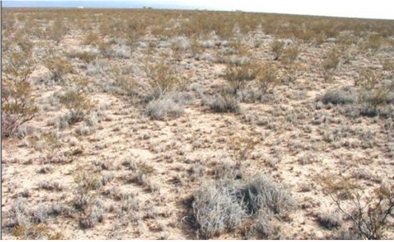
Figure 9. Shrub Dominated

This community supports woody plant composition of creosote bush, tarbush, ephedra, prickly pear species, and cholla. Winterfat will most likely not be in this community because of grazing. The grassland component of this community will be almost non-existent and woody species will dominate this site. Annual herbage production is reduced due to a decline in soil fertility, structure, and organic matter. Plant composition will have shifted strongly toward the non herbaceous component. Because of lowered fertility and competition for nutrients and water from the woody plants the grassland component shows general lack of plant vigor and productivity.