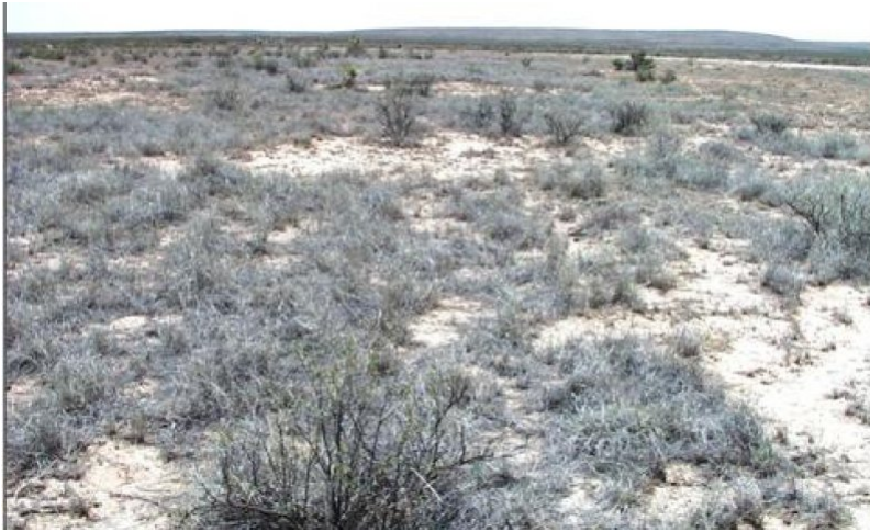
Figure 8. Shrub Invaded

This community supports woody plant composition of creosote bush, tarbush, ephedra, prickly pear species, and cholla. Winterfat will most likely decrease in this community because of increased grazing. There will be a continued decline in diversity of the grassland component and an increase in woody species. Annual herbage production is reduced due to a decline in soil fertility, structure, and organic matter. Plant composition will have shifted strongly toward the non herbaceous component.