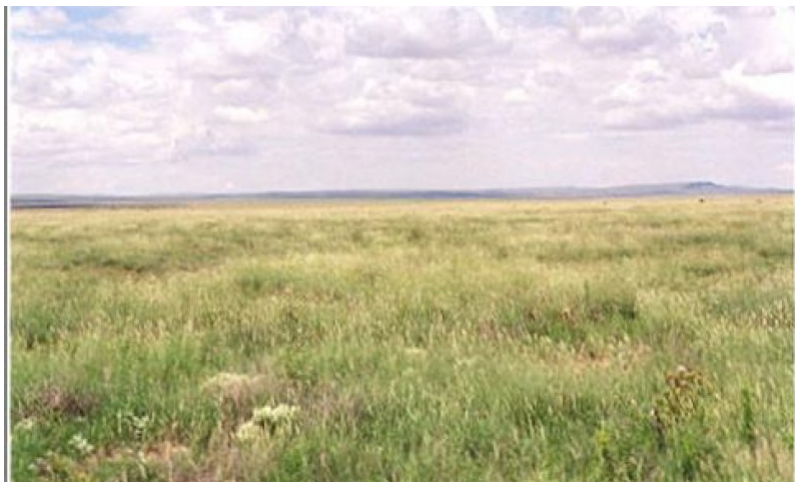
Figure 5. Grassland