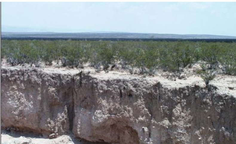
Figure 10. Gullied

Creosote bush/Tarbush and burrograss dominate this site. Because of decrease in herbaceous cover and large interspaces between woody species this site doesn't allow for proper infiltration of precipitation or run-on from adjacent sites thus allowing the soil to erode and cut. These cuts further the drying process on this site thus hindering the this site from healing itself without major management.