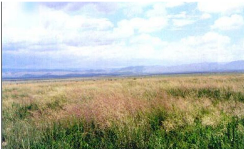
Figure 5. Grassland

Alkali sacaton is the dominant grass of this site both in aspect and composition. Other grass species include vine mesquite, tobosa, blue grama, burrograss, ear muhly and sand muhly. Forbs are only a minor part of the potential plant community and shrubs are absent. The extra water received as overland flow provide the conditions necessary for alkali sacaton to dominate, and its ability to produce from seeds and tillering, and abundant seed production and viability keep it competitive. Other species on this site such as vine mesquite are more palatable and selectively grazed first. As vine mesquite declines tobosa increases. As the site continues to degrade, burrograss increases and eventually broom snakeweed can invade. The invasion of snakeweed may be due in part to the amount of winter moisture received. 1 Large bare patches, hummocks or clumps of alkali sacaton, and heavy concentrations of broom snakeweed are characteristic of the alkali sacaton / broom snakeweed community. As long as the hydrology of the site is not compromised and sufficient cover of alkali sacaton remains, recovery is possible.