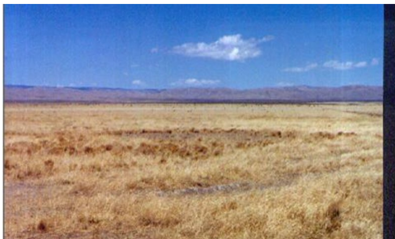
Figure 8. Dry Grassland

Tobosa is dominant or co-dominant with burrograss. Alkali sacaton is absent or very limited. Large interconnected bare patches are present. Production levels are reduced from the Sacaton Grassland State.