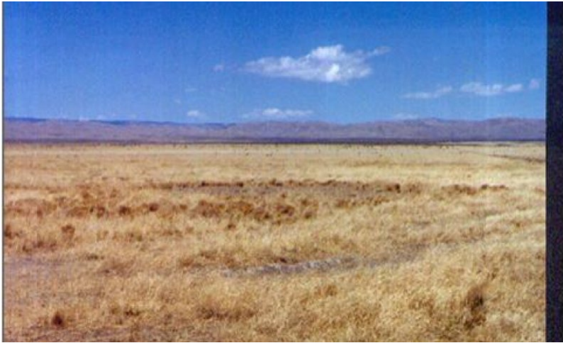
Figure 8. Dry Grassland

Tobosa is dominant or co-dominant with burrograss. Alkali sacaton is absent or very limited. Large interconnected bare patches are present. Production levels are reduced from the Sacaton Grassland State.