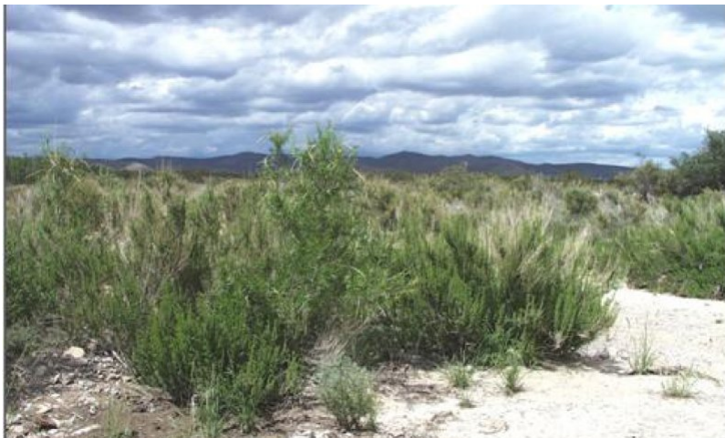
Figure 5. Arroyo Grass/Shrub Mix