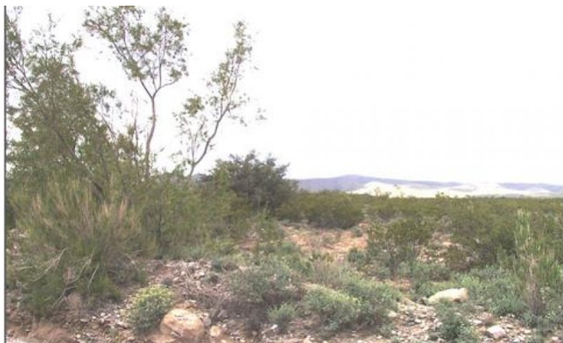
Figure 8. Grass/Shrub Mix

Sideoats grama and cane bluestem are the dominant grass species. Grass cover is high and fairly uniform. Shrubs are mostly confined to the channel border. Runoff is low. Litter movement occurs mainly by water but is restricted by plant cover, usually caught and concentrated around grasses and shrubs. Size class of litter moved is small (1cm.), and distance moved is typically (<1m).