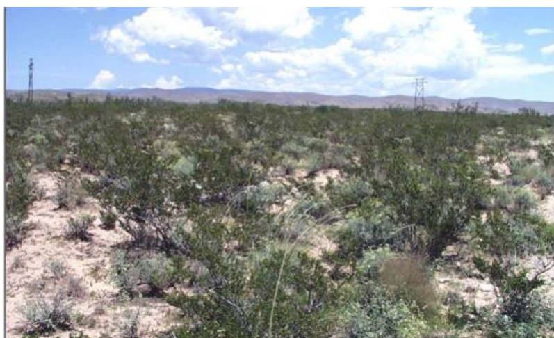
Figure 9. Shrub Dominated

This community is characterized by the dominance of creosotebush. The dominant grasses in this state consist of blue grama, tobosa, or burrograss. Retrogression within this state usually follows the trend of a decrease in the amount of blue grama and an associated increase in tobosa and burrograss. Burrograss may eventually become the dominant grass species. Dropseeds, threeawns, muhly species, fluffgrass and broom snakeweed may also increase in representation.