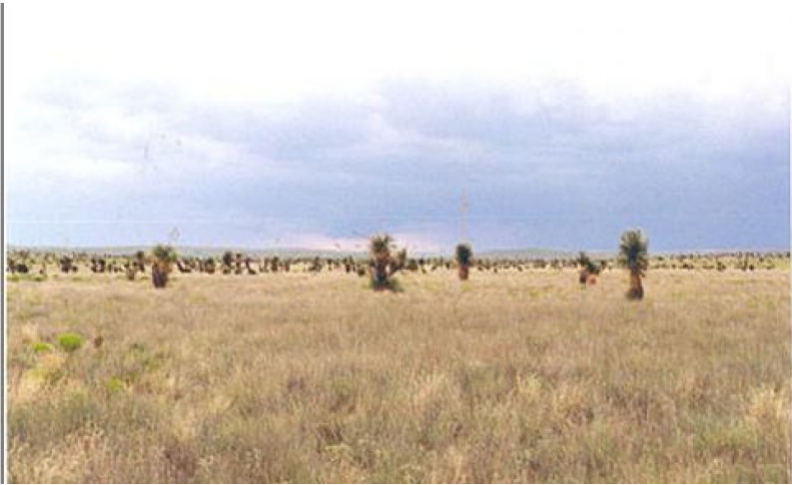
Figure 5. Grassland

Blue grama and black grama are the dominant species. Grass cover is uniformly distributed with few large bare areas. There is little evidence of active rills and gully formation. Litter movement is limited to smaller size class litter and short distances. Creosotebush, tarbush and mesquite are absent.