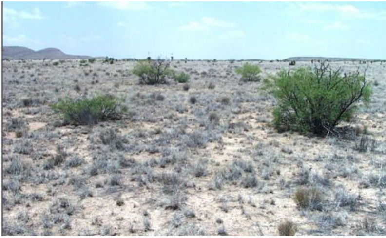
Figure 8. Shrub Invaded

Production is usually reduced from grassland state. Creosotebush, tarbush or mesquite is present. Grass cover varies from near grassland conditions to patchy, with bare areas present and usually larger around invading shrubs.