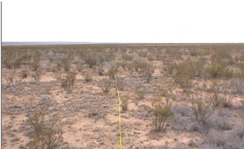
Figure 9. Shrub Dominated

Grass production is minimal for site potential. Shrub cover is high, exceeding that of grasses. Erosion is apparent and rills or gullies may be present. Physical crusts are present in bare areas and biotic crusts are present around shrubs and in bare areas.