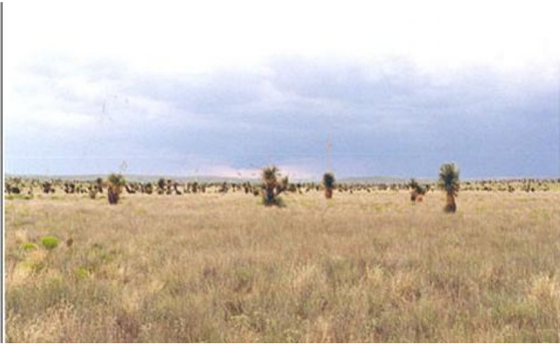
Figure 5. Grassland

Blue grama and black grama are the dominant species. Grass cover is uniformly distributed with few large bare areas. There is little evidence of active rills and gully formation. Litter movement is limited to smaller size class litter and short distances. Creosotebush, tarbush and mesquite are absent.