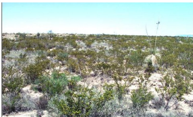
Figure 8. Shrub Dominated

Creosotebush is the dominant species. Grass cover is no longer uniformly distributed, instead tending to be patchy