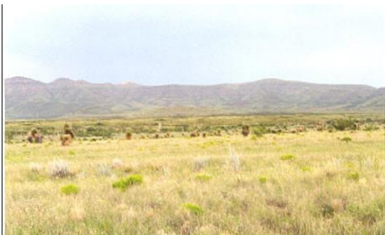
Figure 5. Grassland

Grasses dominate the historic plant community with shrubs evenly distributed throughout. Black grama and blue