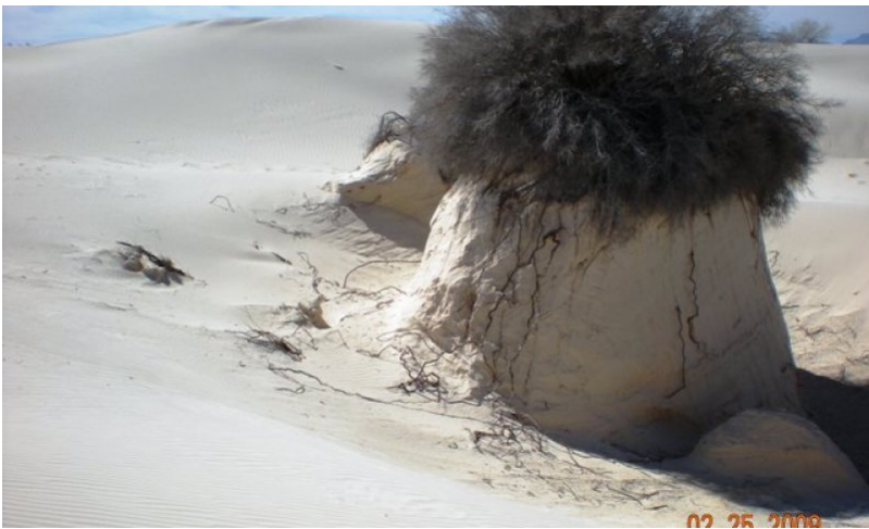
Figure 6. Plant pedestal