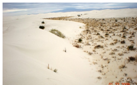
Isolated shrubs or grasses

Seed dispersal and periods of favorable moisture may enable plants to establish on the dune surface. Plants must also possess rapid growth characteristics to enable them to grow faster than the burial rate.