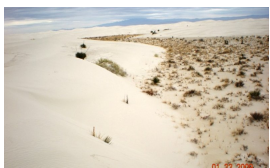
Isolated shrubs or grasses