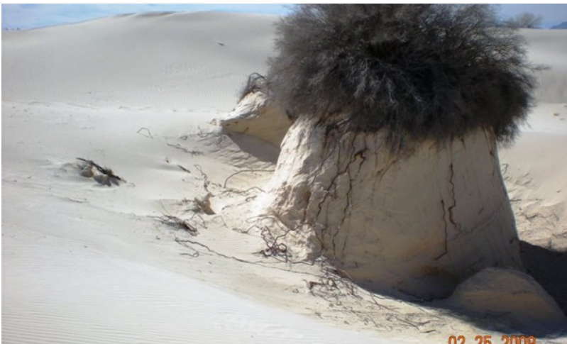
Figure 6. Plant pedestal