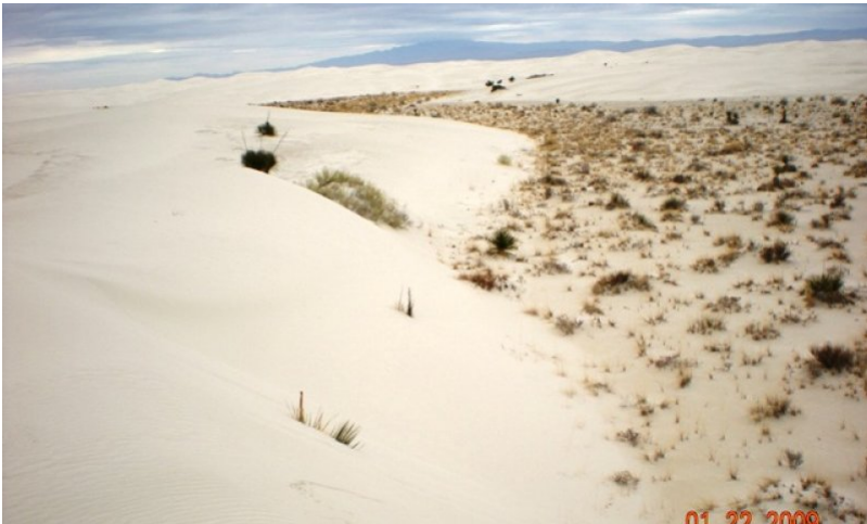
Figure 5. Isolated Shrubs or grass

Dunes on this site are typically barren. This is believed to be due to high rates of erosion and deposition encountered across the dunes. This makes it extremely difficult for plants to establish on the dunes. Additionally the water table associated with these dunes is moderately to strongly saline.