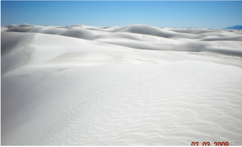
Figure 4. Gyp Duneland Barren

Dunes on this site are typically barren. This is believed to be due to high rates of erosion and deposition encountered across the dunes. This makes it extremely difficult for plants to establish on the dunes. Additionally the water table associated with these dunes is moderately to strongly saline.