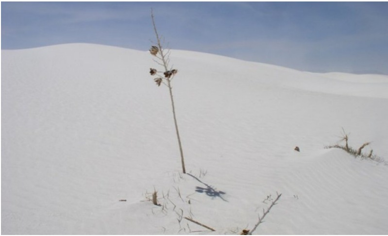
Figure 7. Plant burial

Occasionally plants do occur on the dunes. In some instances plants establish on the interdune and due to dune migration eventually become part of the advancing dune face. Or, relatively fast growing plants such as grasses and some shrubs can establish on the leeward side of the dune. In both instances the plants typically do not last long. Plants on the dunes are constantly undergoing deposition and most are eventually buried. Alternatively, in some instances plant capped pedestals can form where plants temporarily stabilize dune sediments and the surrounding sediments erode as the dune moves forward. The resulting pedestals remain and become part of the interdune until the plants die and the pedestal is eroded away.