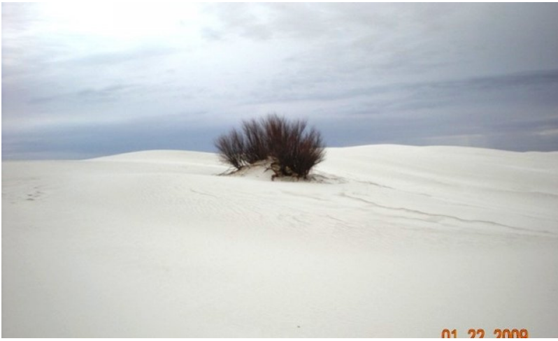
Figure 8. Saltcedar Invaded

In some instances saltcedar is able to establish on these dunes. This may tend to occur during years when these sites experience unusually wet spring or early summer rains and the soil surface remains saturated for a few weeks. These periods of saturation provide moisture and dune stability necessary for plant establishment. Once established, saltcedar can grow very rapidly, attaining several feet in height during a single growing season. These plants are usually solitary individuals attesting to the harsh conditions of establishing among the dunes. Transitions to Exotic-Dominated seem unlikely. Occasionally, pedestals capped by saltcedar can form when the saltcedar temporarily stabilizes dune sediments and the surrounding sediments erode as the dune advances.