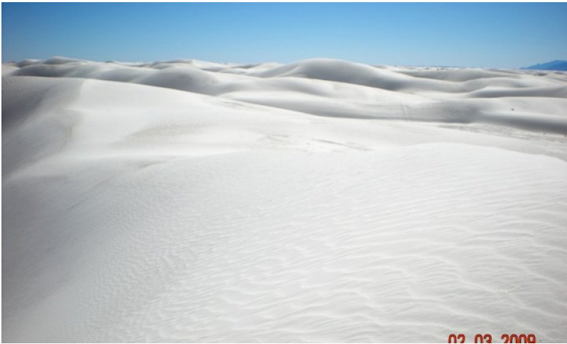
Figure 4. Gyp Duneland Barren

Dunes on this site are typically barren. This is believed to be due to high rates of erosion and deposition encountered across the dunes. This makes it extremely difficult for plants to establish on the dunes. Additionally the water table associated with these dunes is moderately to strongly saline.