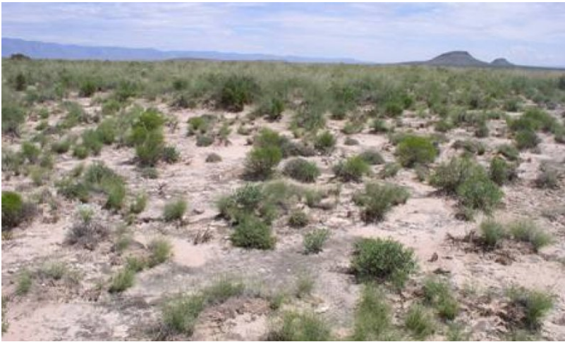
Figure 5. Grass/Mixed shrub

The Grass/Mixed shrub community is believed to be the historic plant community for this site. It is naturally a patchy mixture of grasses and shrubs dominated by gyp dropseed and hairy crinklemat. Torrey's ephedra, fourwing saltbush, alkali sacaton, and gyp monopod are also commonly found on this site.