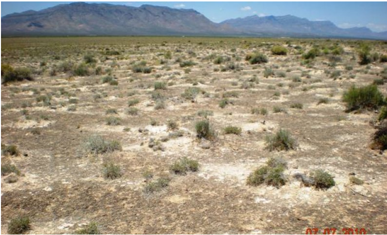
Figure 7. Mixed-Shrub community