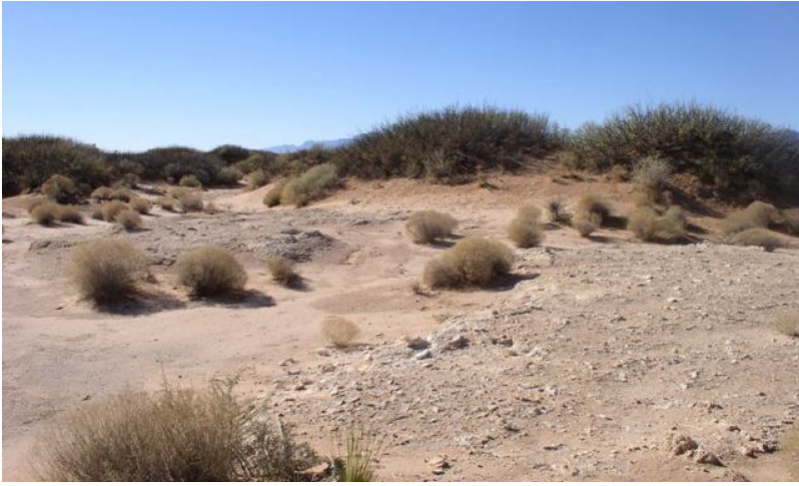
Figure 10. Barren

Grass/Shrub Mix =>Shrub Dominated Transitions to a Shrub Dominated state may result from continuous heavy grazing pressure or periods of extended drought. These sites are naturally fragile and care should be taken not to overgraze.