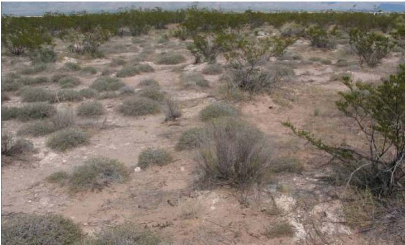
Figure 8. Mixed-Shrub w/creosotebush

This State is Characterized by a decrease in grass cover resulting in dominance of the shrub component. Hairy crinklemat is dominant with fourwing saltbush or Torrey’s ephedra typically occurring as sub-dominant. Occasionally creosotebush is present. This typically occurs where the soils of the site or adjacent sites contain calcium carbonate. Other important species include, gyp moon pod, stinging cevallia, and pitchfork, Grass cover is sparse usually consisting of scattered gyp dropseed. High cover of biological crusts helps to limit erosion and retain soil moisture. It is not known if they enhance or limit seedling establishment on these sites.