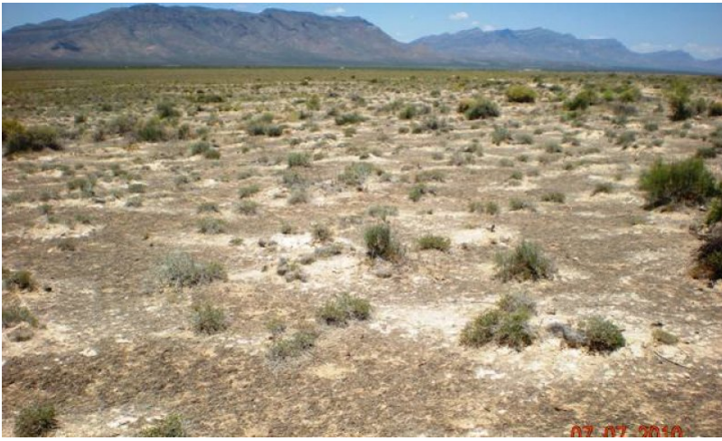
Figure 7. Mixed-Shrub community