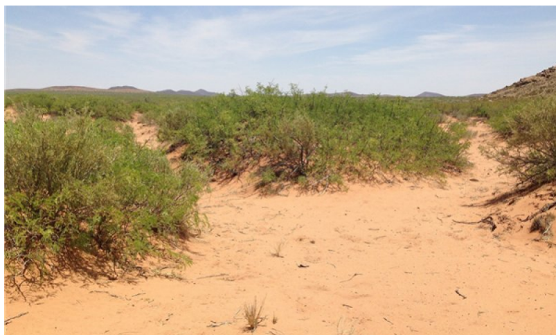
Figure 7. mesquite dune state

Mesquite dune: In many areas, only a few species of shrubs may dominate, shrub and grass cover is sparse, and mesquite may form coppice dunes. Where gravel content is high (e.g., >5%), creosotebush ( Larrea tridentata ) may also be present. In some cases, mesquite may be extremely dominant and few other shrubs are present. On sandhills, little-leaf sumac may attain extreme dominance instead of mesquite. Dynamics within this state may occur and be attributable to climate or grazing-associated disturbances (e.g. trampling of shrubs) or to off-road vehicle activity. In general, wind and water erosion rates appear to be high in this state due to the low plant cover, and this likely maintains very low soil fertility. The conditions under which mesquite attains dominance are not understood. Diagnosis: Dropseed cover sparse to absent. Bare ground patches are large, forming blowouts and “streets” (i.e. elongated patches in the direction of prevailing winds). Evidence of interdune erosion (pedestalling, blowouts) are present. Transition to dropseed-dominated state (2b): Possibly with seeding and/or shrub removal with herbicides. Soil stabilization and fertility amendments would probably be needed; this has not been attempted. Transition to broom dalea-sand sage state (3b): Strategy unknown. Information sources and theoretical background: Communities, states, and transitions are based upon information in the ecological site description and observations by Jim Powell, NRCS (retired)