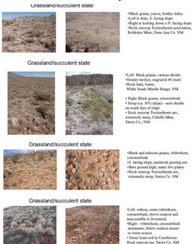
Figure 4. Grassland/succulent state