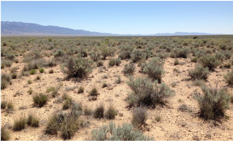
Figure 7. Mesa dropseed / Sand sagebrush