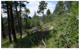
Ponderosa Pine/Oak/Muhly Community