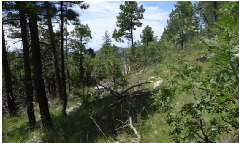
Figure 7. 1.3 Ponderosa Pine/Oak/Muhly Community

This community is an intermediate seral stage. Lack of fire or other disturbances is allowing succession to occur. Numerous seedlings of ponderosa pine as well as Douglas fir and southwestern white pine are being established. Shade intolerant warm season grasses dominate the grass layer.