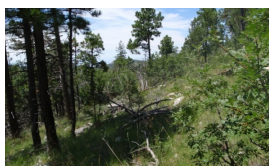
Ponderosa Pine/Oak/Muhly Community

Due to intermediate succession and change of plant species composition, the Oak-Locust/Muhly-Fescue/Pine-Fir Community will shift to the Pine-Fir/Oak Community.