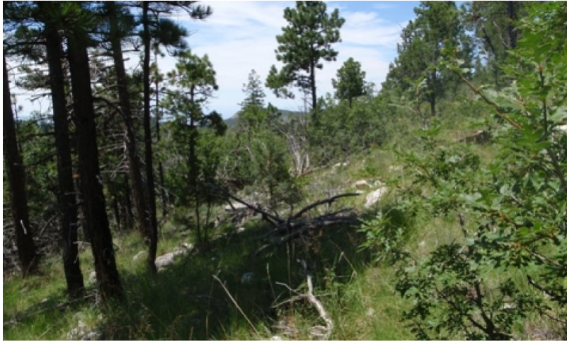
Figure 7. 1.3 Ponderosa Pine/Oak/Muhly Community

This community is an intermediate seral stage. Lack of fire or other disturbances is allowing succession to occur. Numerous seedlings of ponderosa pine as well as Douglas fir and southwestern white pine are being established. Shade intolerant warm season grasses dominate the grass layer.