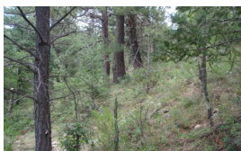
Ponderosa Pine-Douglas fir-Southwestern White Pine/Oak-Serviceberry/Muhly Community