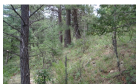
Ponderosa Pine-Douglas fir- Southwestern White Pine/Oak- Serviceberry/Muhly Community