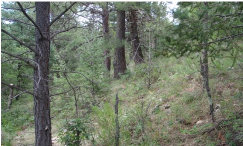
Figure 4. Approximate HCPC

This community is the potential or reference plant community. It is characterized by a slight dominance of ponderosa pine in the forest over-story although associated species such as Douglas fir and/or southwestern white pine can dominate favorable micro-sites such as drainageways. Gambel's oak is a common understory tree. Other trees and shrubs include knowlton's hophornbeam, Utah serviceberry, mescalero currant, cliff fendlerbush, and silver mountain mahogany. A combination of mid/tall grasses and warm/cool season grasses dominates the herbaceous layer. The occurrence of natural fires prevents this community from being a closed canopy throughout the extent of the site.