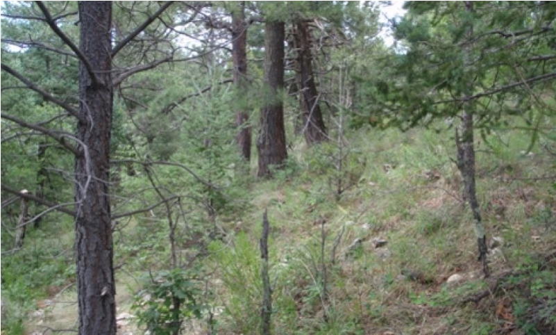
Figure 4. Approximate HCPC

This community is the potential or reference plant community. It is characterized by a slight dominance of ponderosa pine in the forest over-story although associated species such as Douglas fir and/or southwestern white pine can dominate favorable micro-sites such as drainageways. Gambel's oak is a common understory tree. Other trees and shrubs include knowlton's hophornbeam, Utah serviceberry, mescalero currant, cliff fendlerbush, and silver mountain mahogany. A combination of mid/tall grasses and warm/cool season grasses dominates the herbaceous layer. The occurrence of natural fires prevents this community from being a closed canopy throughout the extent of the site.