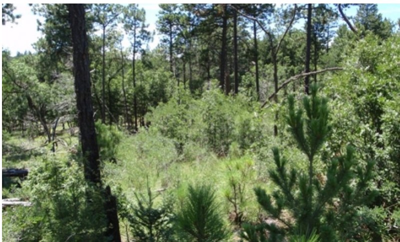
Figure 6. 1.2 Oak-Locust/Muhly-Fescue/Mixed Conifer

This community is characterized by a dominance of Gambel's oak and New Mexico locust with abundant warm shade intolerant warm season grasses such as big bluestem, yellow indiagrass, little bluestem, and numerous muhly grasses. The community is in the early stages of secondary succession caused by fire, disease, and/or drought.