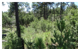
Oak-Locust/Muhly-Fescue/Mixed Conifer Community

overstory canopy is reduced due to natural disturbances such as low intensity fires, disease, insects, and drought conditions.