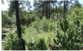
Oak-Locust/Muhly-Fescue/Mixed Conifer Community

Overstory reduced due to natural disturbances such as low intensity fire, disease, and/or drought.