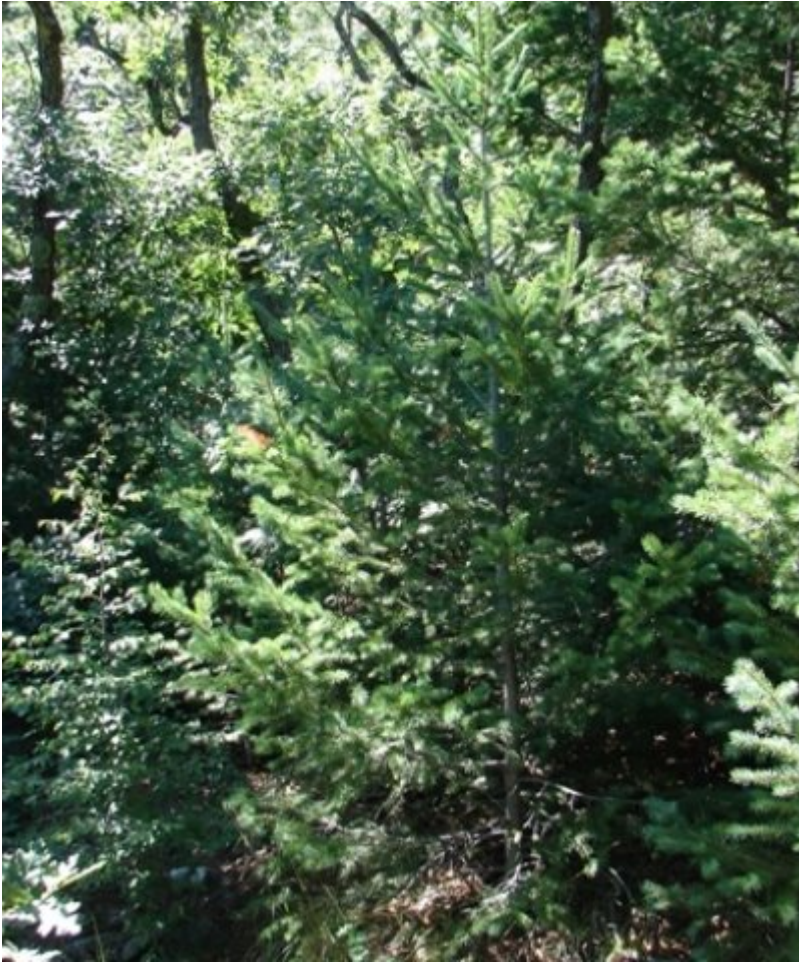
Figure 8. Douglas-fir-Mixed Conifer/Oak-Serviceberry

This community is characterized by a dominance of Douglas fir with associated ponderosa pine and southwestern white pine. Gambel's oak is a common understory shrub or small tree. Few shade tolerant grasses exist. Canopy cover of trees can range up to 95 percent. Fine fuels needed to carry low severity fires are very limited.