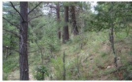
Ponderosa Pine-Douglas fir-Southwestern White Pine/Oak-Serviceberry/Muhly Community

The Pine-Fir/Oak Community can shift to the Douglas-fir-Pine/Oak-Serviceberry Community due to Plant Succession.