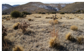
Mixed-bunchgrass Grassland Community