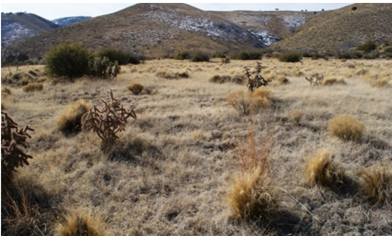
Figure 4. 1.1 Mixed-bunchgrass Grassland Community