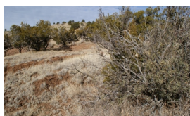
Oneseed Juniper/Pinyon Pine Woodland Community