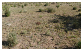
Blue grama/Annual Forbs Community