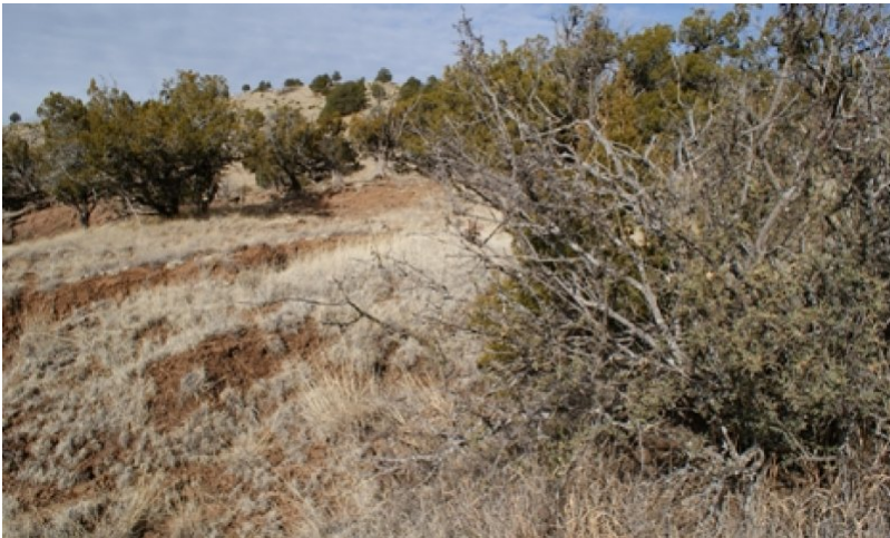
Figure 8. 1.3 Juniper/Pine Woodland Community

In some areas where possibly there is lower soil moisture, different soil texture, and/or there is an available seed source, a oneseed juniper-pinyon pine community exists. It is unclear if they exist due to past disturbance or they are a part of the natural variability of the site. High densities of oneseed juniper did occur near an old stock tank at GUMO, indicating encroachment due to past disturbances. Prescribed fire can be used to reopen the woodland community into a more open grassland. No evidence a state change where there is a complete loss of grass cover or where a fire threshold has been crossed, perhaps due to the site's resiliency and/or climate.