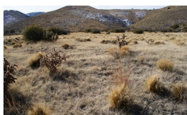
Mixed-bunchgrass Grassland Community

With Prescribed Burning and Prescribed or No Grazing conservation practices, the Oneseed Juniper/Pinyon Pine Woodland Common can revert back to the Mixed-bunchgrass Grassland Community.