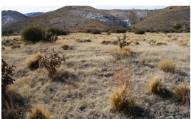
Mixed-bunchgrass Grassland Community