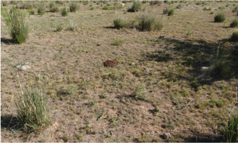
Figure 7. 1.2 Blue grama/Annual Forbs Community

This plant community is the result of heavy continuous grazing. Palatable grasses such as western wheatgrass and vine mesquite have been reduced. Blue grama has transitioned to a sod-bound turfgrass and dominated the grass component. Many annual and perennial forbs have increased. Prescribed grazing or no grazing will help the community return to the reference community.