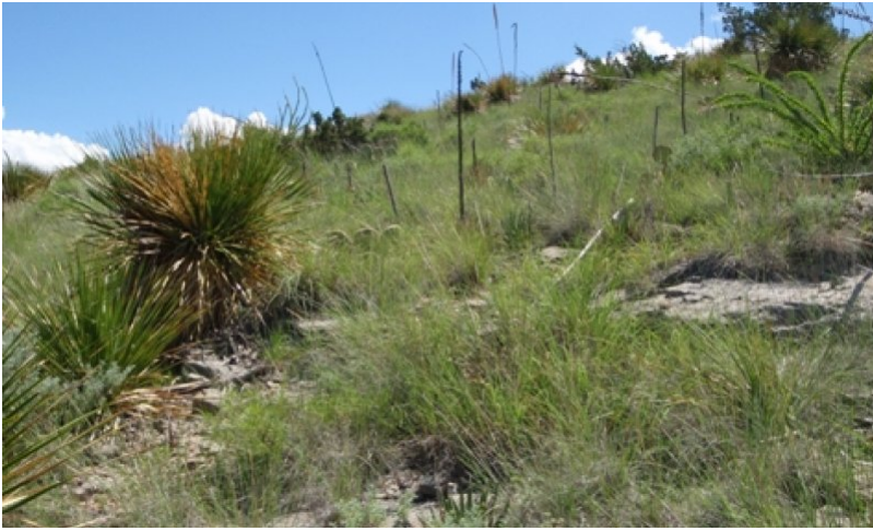
Figure 4. 1.1 Midgrass/Mixed-shrub/Forb Community

This plant community occurs primarily on south facing slopes and ridgetops. The community is characterized by midgrasses such as blue grama, sideoats grama, curlyleaf muhly, and black grama and shrubs such as yuccas, sotol, ocotillo, lechuguilla. Some redberry juniper and wavyleaf oak along with a higher productivity of grasses can be found in some south facing slopes, usually in higher elevations or in areas transitioning to a cooler and wetter climate. The overall warmer and drier soil climate in this community limits trees such as pinyon pine and gray oak. In some areas fire probably is not very influential in shaping the plant communities due to continuities in fine fuels limit the extent and frequency of fires. In more mesic areas where this site occurs such as Guadalupe Mountains National Park, fine fuel productivity is higher and fire does play a role in suppression shrubs.