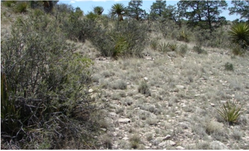
Figure 9. 3.2 Shortgrass/Tree/Shrub Community

This plant community is the result of heavy continuous grazing. Palatable grasses such as blue grama and New Mexico muhly decrease while unpalatable grasses such as threeawns, hairy grama, and slim tridens increase. Sideoats grama initially increases following overgrazing and will ultimately decrease with continued overgrazing. Annual grasses and forbs are more abundant in this phase.