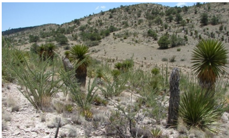
Figure 7. North Facing Slopes in Background

This plant community is the reference on north facing slopes or in mesic areas of the site. Pinyon pine, redberry juniper, wavyleaf oak are scattered among grasses such as blue grama, sideoats grama, curlyleaf muhly, New Mexico muhly, and New Mexico feathergrass. Pine muhly can be found in places. Common shrubs include mountain mahogany, desert ceanothus, and agarito. Canopy cover of pinyon ranges from 10-50 percent depending on fire history. Natural fires play an important role in maintaining this community.